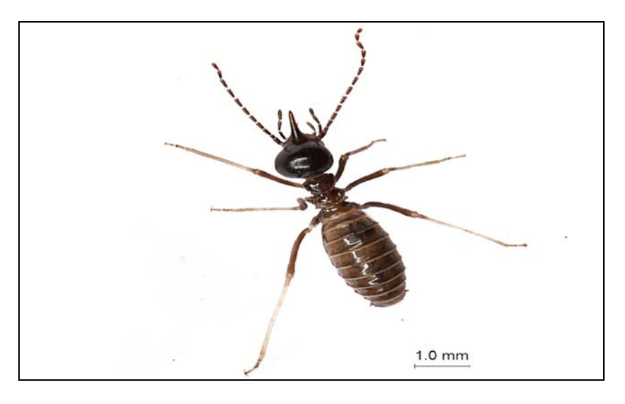
Fig 4: H. monoceros –soldier caste (dorsal view)

soldiers who were initially unaware about the ant intrusion were soon agile, but only after being bounded by a few workers. This triggered a conspicuous side to side oscillatory movement of the soldiers, ultimately driving away the ants out of the column, probably by squirting the terpene secretions from the nasus. This documented instance proves that apt positioning of the soldiers is crucial in wading away their enemies.