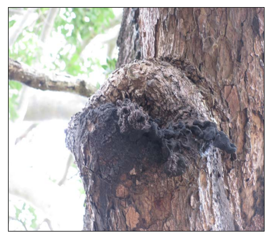
Fig 2: Arboreal nest on tree