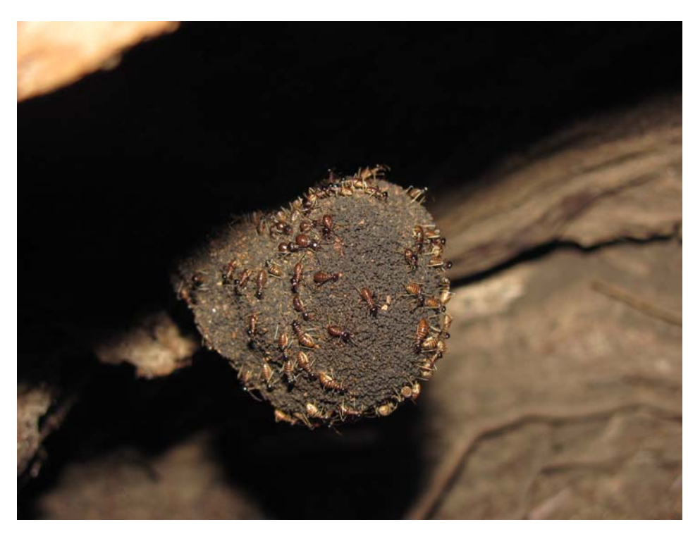
Fig 6: Nest building in progress