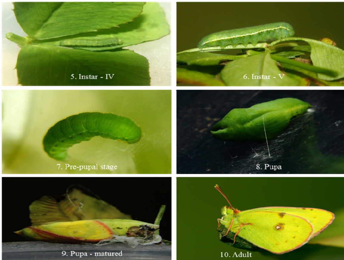
Fig 3: Life cycle stages of Colias nilagiriensis – Nilgiri Clouded Yellow from Egg to Adult

Hindwing with greenish scales, an orange-red spot on the costal a little beyond the middle, yellow with black spot, cilia of both wings are orange-red, the costal line of the hindwing follows the same. Female, upperside white, forewing marked as in the male. Underside markings also similar, but the white ground colour of the wings gives them a brighter appearance. (Fig.2. C and D). Body stout, thorax and head very hairy, palpi short, laterally compressed and densely hairy beneath, antenna rather short, stout with a gradually thickened elongated in blunt club and tarsus without appendages.