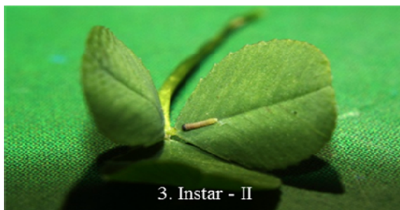
3. Instar - II