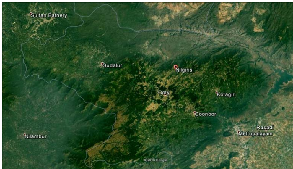
Fig 1: Map showing study area – The Nilgiris District, Tamil Nadu

Pulney Hill-Tops (Fyson, 1920-1975) [16] and Flora of Palni Hills (Matthew, 1999) [17]. Photographs were made using Canon 18-55mm and Nikon 90mm.