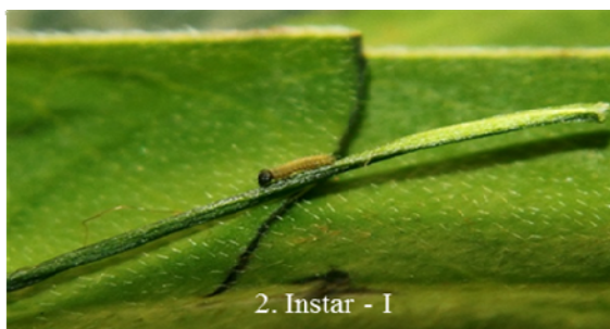
2. Instar - I