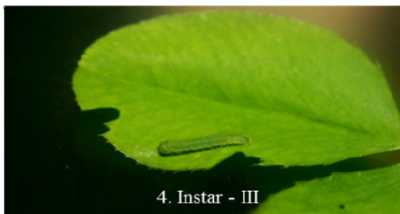
4. Instar - III