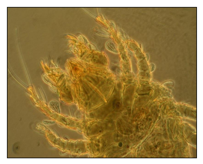
Fig 5: Cheletogenes ornatus - adult female (original)

(Lichtenstein) (Hemiptera: Diaspididae). It was found on Taxus baccata L. in Karlovo.