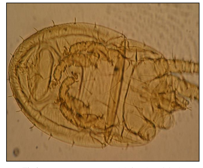
Fig 2: Pentamerismus taxi - adult female (original)