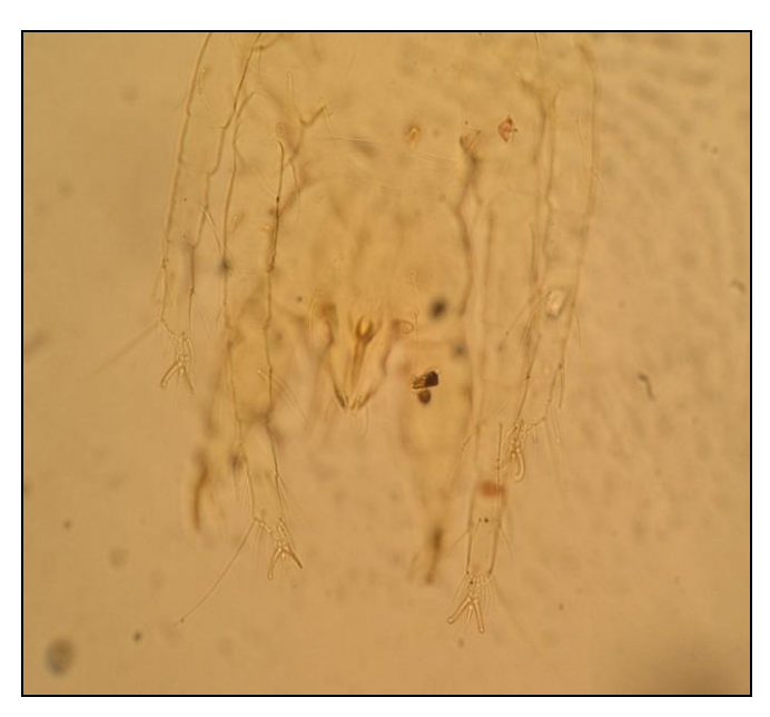
Fig 6: Zetzellia silvicola - adult female (original)

Remarks: Zetzellia silvicola was found in all colonies of Pentamerismus taxi . The species has a potential to reduce its population. It was found on Taxus baccata L. in Sofia. The other 2 species known from Bulgaria are Zetzellia mali (Ewing) and Zetzellia graeciana Gonzales [1].