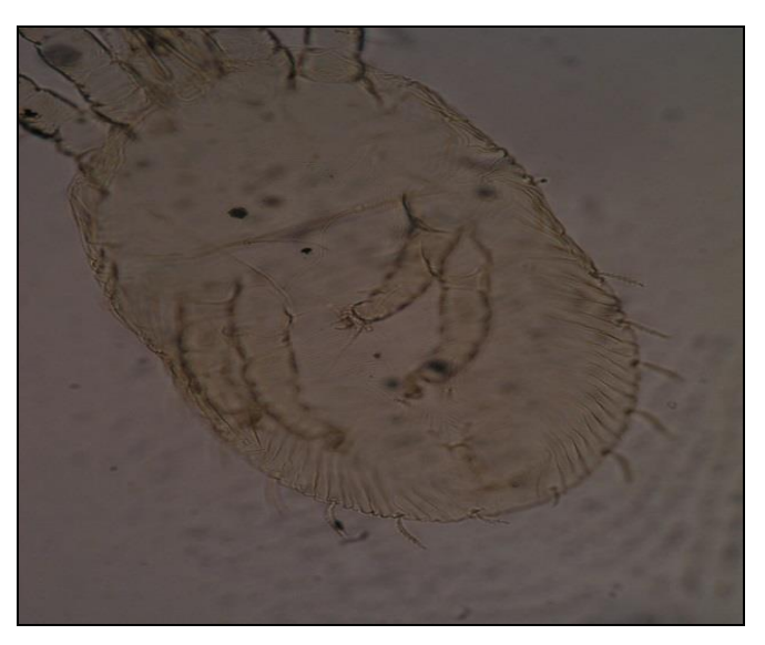
Fig 4: Cenopalpus lineola - adult female (original)

Remarks: Cenopalpus lineola was collected from Sofia on Taxus baccata L. This is the first record of this species in Bulgaria.