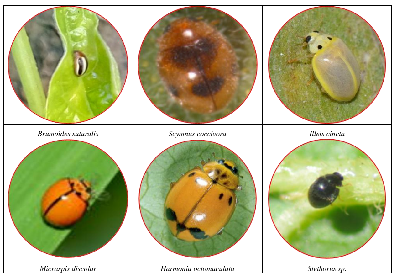
Plate 1: Predatory Coccinellid Species in Organic Vegetable Field, NIPHM, Rajendranagar 2016-17