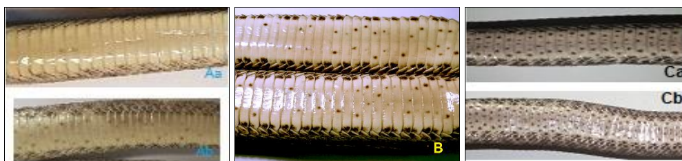
Fig 6: Ventral patterns of Echis from Zabol region without spot (Aa) or 1 small spot (Ab), Echis from Ghaen vent with 1-2 deep and uniform spots (B), Khozestan area vent marked with 2-5 dark spots (Ca-Cb).

ventral patterns were similar to the report of Rhadi et al. [16]