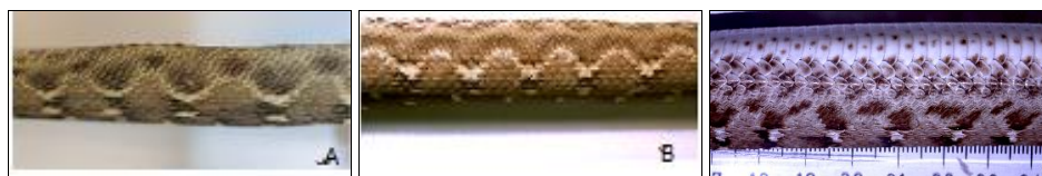
Fig 5: Lateral patterns of Echis from Zabol (A) Ghaen (B) and Aghajari (C)

Variety has been reported in the ventral pattern and color in Iranian Echis. In the Echis of Zabol, GHaen and Khozestan