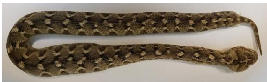
Fig 1: Echis Snake from Sistan Baluchistan Province, south east of Iran

In this study, we studied the morphological traits of the Echis populations collected from three provinces: Sistan and Baluchistan (southeast), Southern Khorasan (East) and Khuzestan (southwestern) in Iran (Figures 1-3). The results of 6 morphological, 14 meristic and 4 morphometric characters in 21 snakes from three provinces showed that the Iranian Echis snake was relatively small in size, and the adult's body length were lesser than one meter. Head length was short, broad, pear-shaped and distinct from the neck, and muzzle were short and round, while the eyes were fairly large and protruding and the pupil was vertical. Their heads were covered with small and irregular scales, their body was relatively narrow and cylindrical. A short tail with a narrow tip, a single anal plate, and an undivided subcaudal scales was seen. Statistical analysis showed that there were significant differences between four morphometric characters of body length and tail length and head width in Echis snakes from three provinces ( P \leq 0.05 ). In four meristic characters; there were significant differences in the number of ventral scales, subcaudals, dorsals and lateraloblique scales in the three populations ( P \leq 0.05 ). There were no significant differences in the other ten meristic characters (Tables 1).