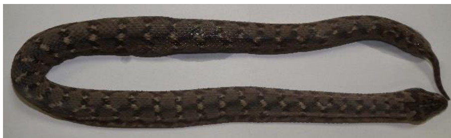
Fig 3: Echis snake from Khuzestan Province, Southwest of Iran