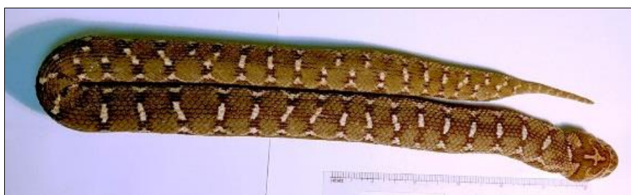
Fig 2: Echis Snake from South Khorasan Province, East of Iran