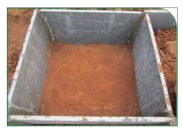
Plate 3: Microplot (1.2 \times 1.2 \times 0.5 \text{ m}) built with Kadapa slabs