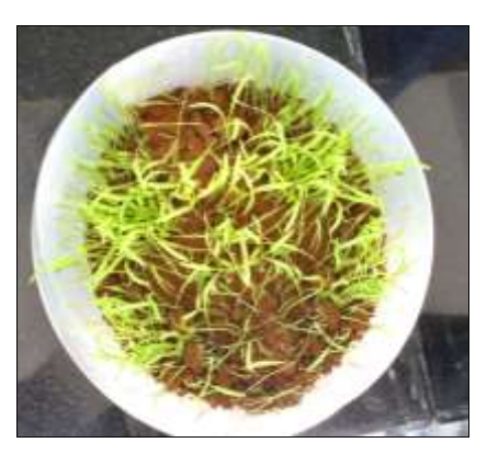
Plate 2: Bajra seedling in pneumatic trough used as feed during rearing of grubs