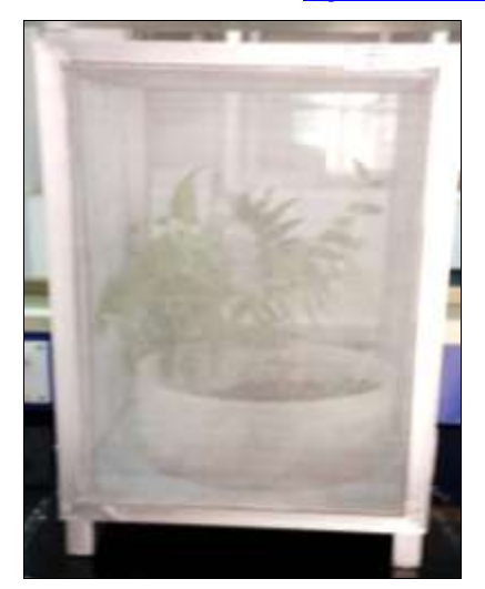
Plate 1: Rearing cage used for root grub adult beetles rearing, mating and oviposition