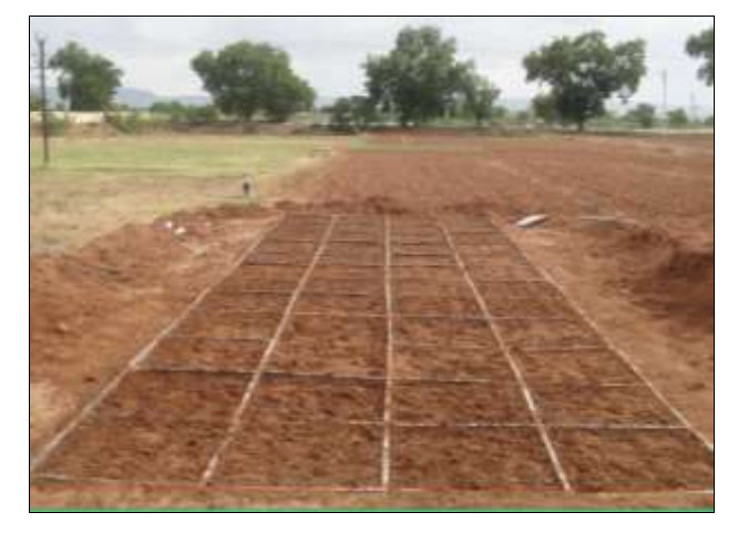
Plate 4: Microplots constructed for conducting experiment on management of root grubs