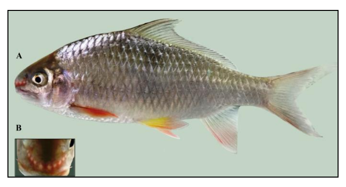
Fig 1: Assamese kingfish caught from the Senki River, Arunachal Pradesh

the body is laterally silvery, dorsally dark extremely deep and laterally compressed. Except for dorsal fin, all fins are yellowish orange in color. The dorsal fin has four osseous simple and 23-25 branched fin rays. The snout has a transverse row of 10-12 open pores. A single maxillary barbel pair is present in the groove at the corners of the mouth (Fig 1). Lateral line has 31-33 scales <sup>[12, 41]</sup>. However, integrative taxonomy approach which is a combination of morphological and molecular approaches could be crucial in overcoming the taxonomic controversy and in expanding our understanding of the taxonomy and diversity of Assamese Kingfish.