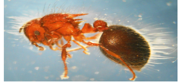
Meranoplus bicolor Guerin-Meneville