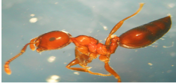
Crematogaster subnuda Mayr