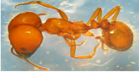
Solenopsis geminata Fab