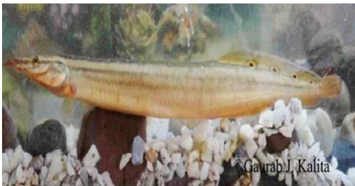
Fig 52: Macrognathus aral