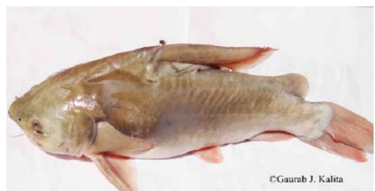
Fig 37: Rita rita