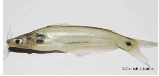
Fig 44: Neotropius atherinoides