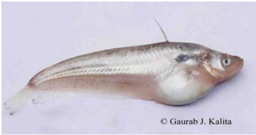
Fig 40: Ompok pabo