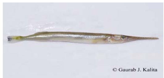
Fig 49: Xenentodon cancila