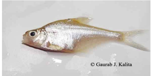
Fig 23: Osteobrama cotio