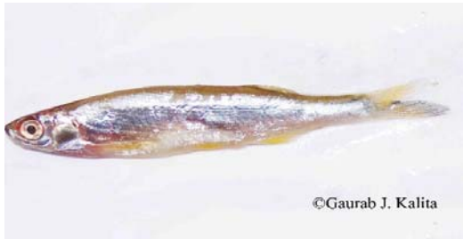
Fig 29: Salmostoma bacaila