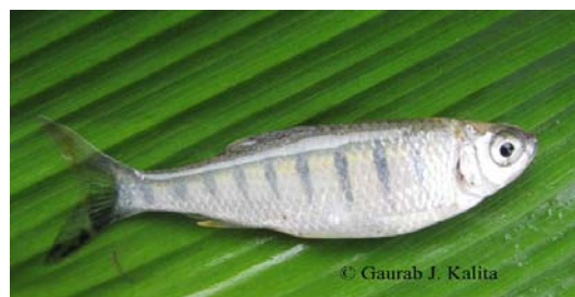
Fig 11: Barilius bendelisis