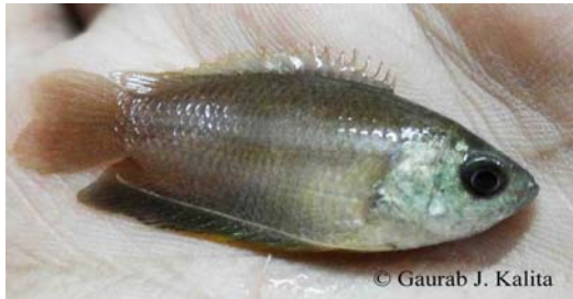
Fig 62: Trichogaster chuna