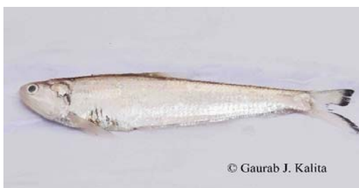
Fig 6: Setipinna phasa