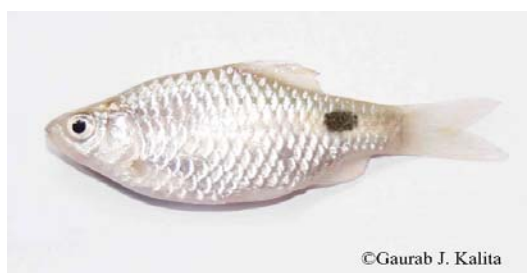
Fig 25: Puntius conchonius