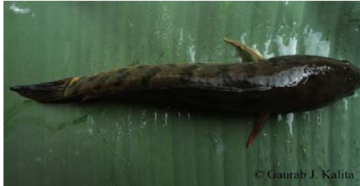
Fig 63: Channa punctatus