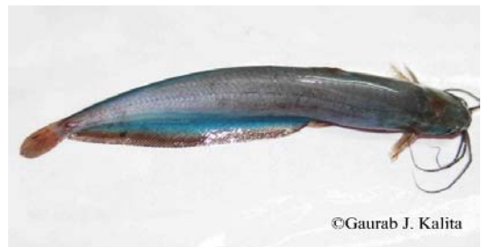
Fig 47: Heteropneustes fossilis