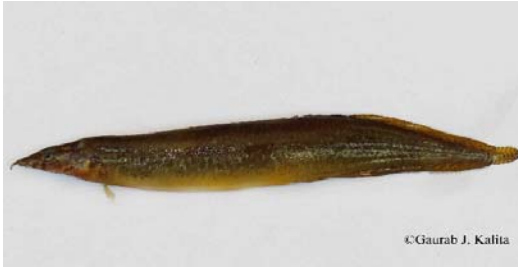
Fig 51: Macrognathus pancalus