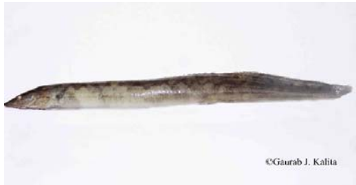
Fig 53: Mastacembelus armatus