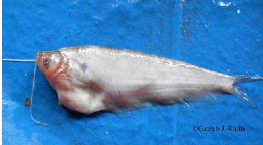
Fig 39: Ompok bimaculatus