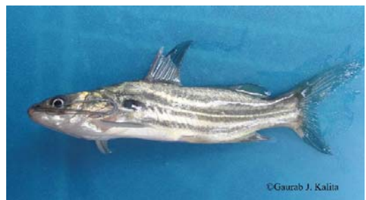
Fig 36: Mystus vittatus