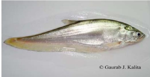
Fig 3: Notopterus notopterus