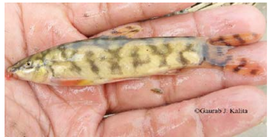
Fig 34: Botia dayi