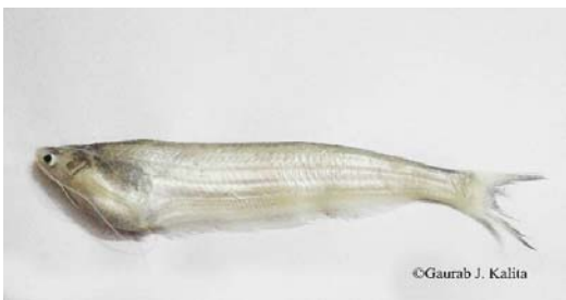
Fig 42: Ailia Coila