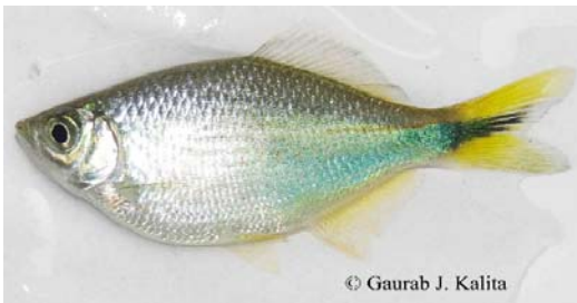
Fig 16: Devario devario