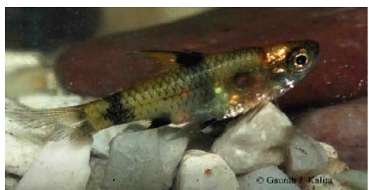
Fig 24: Puntius phutunio