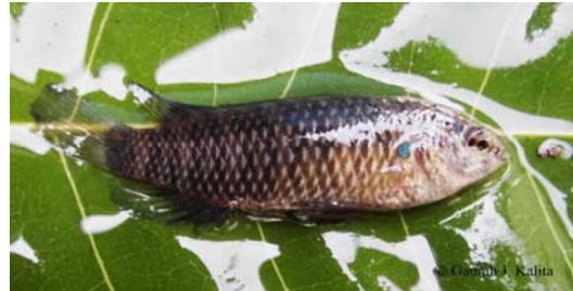
Fig 59: Badis badis