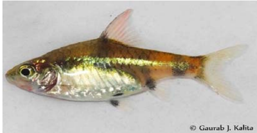
Fig 27: Puntius gelius