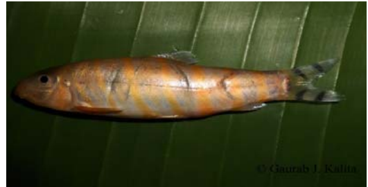
Fig 33: Botia dario