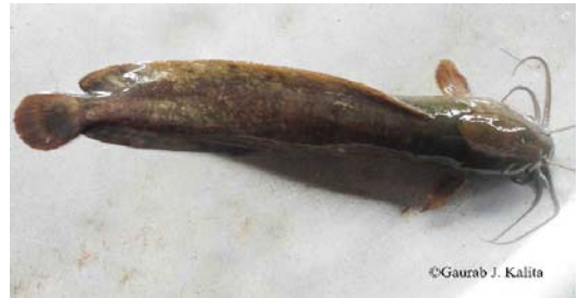
Fig 46: Clarias batrachus