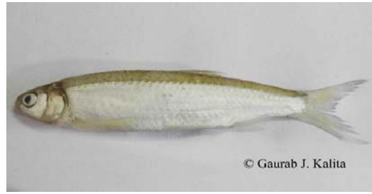
Fig 8: Aspidoparia jaya