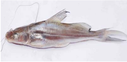
Fig 38: Sperata seenghala