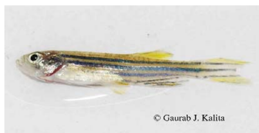
Fig 12: Brachydanio rerio