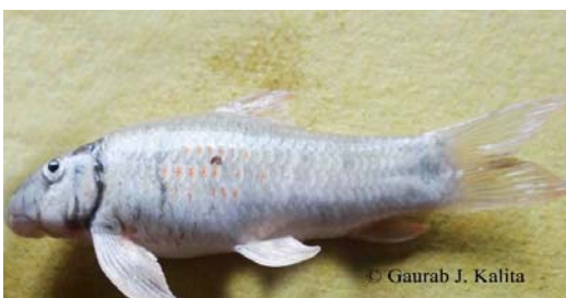
Fig 18: Garra gotyla