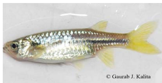
Fig 13: Esomus danricus