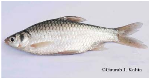
Fig 26: Puntius sarana