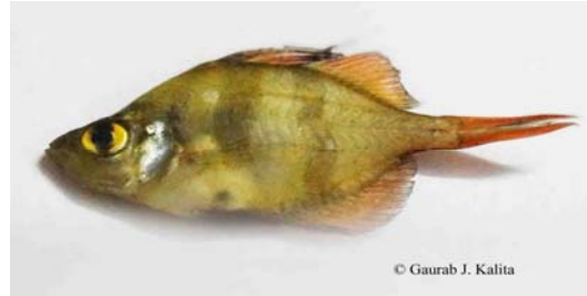
Fig 57: Parambassis lala