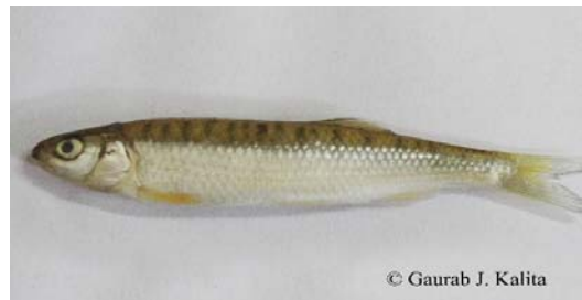
Fig 10: Barilius barila