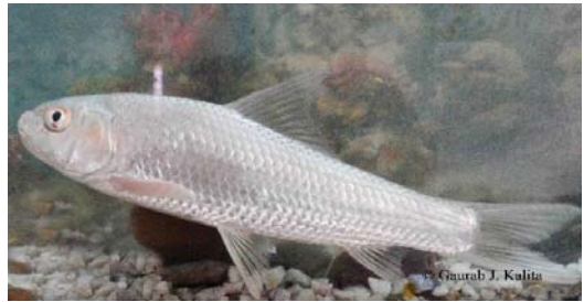
Fig 20: Labeo bata