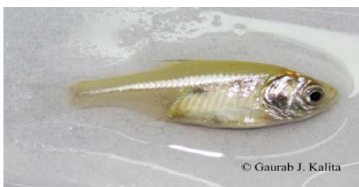
Fig 7: Amblypharyngodon mola