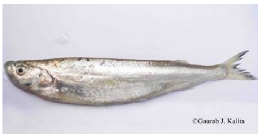
Fig 30: Securicula gora