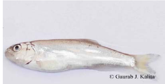
Fig 9: Aspidoparia morar