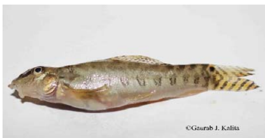
Fig 31: Acanthocobitis botia