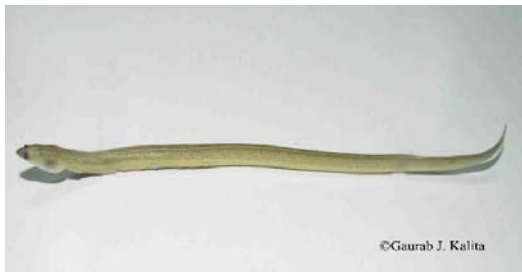
Fig 4: Pisodonophis boro