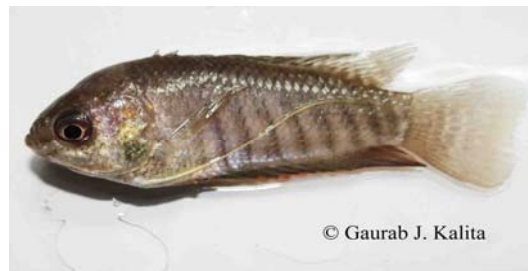
Fig 60: Trichogaster fasciata