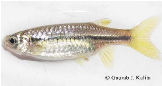
Fig 14: Rasbora daniconius