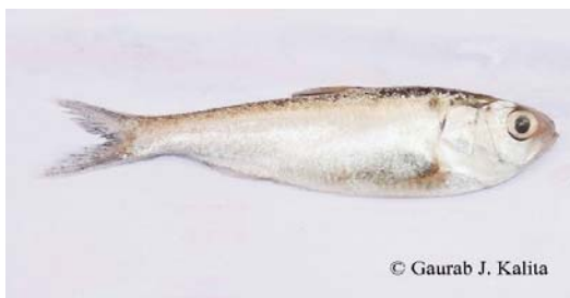
Fig 5: Gudusia chapra