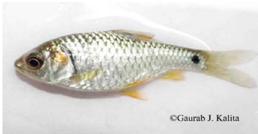
Fig 28: Puntius sophore