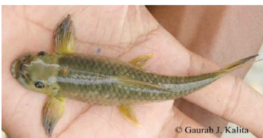
Fig 19: Garra nasuta