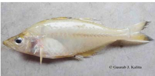
Fig 54: Chanda nama