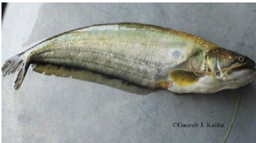
Fig 41: Wallago attu