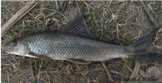
Fig 17: Garra lamta