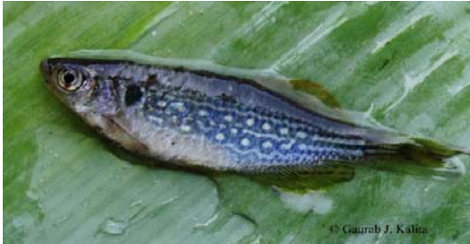
Fig 15: Danio dangila