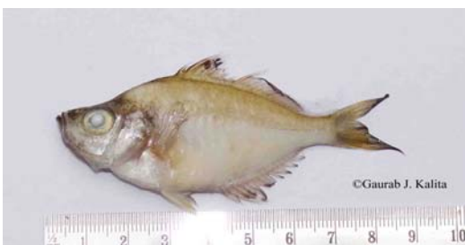
Fig 55: Parambassis ranga