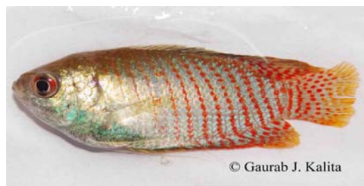
Fig 61: Trichogaster lalia