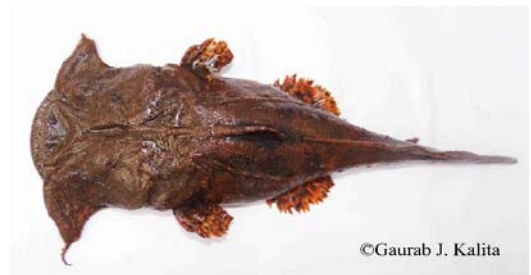
Fig 48: Chaca chaca