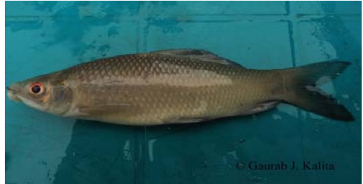
Fig 21: Labeo calbasu