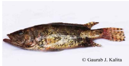
Fig 58: Nandus nandus