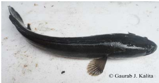
Fig 64: Channa striata