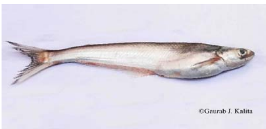
Fig 43: Eutropiichthys vacha