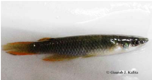
Fig 50: Aplocheilus pancha