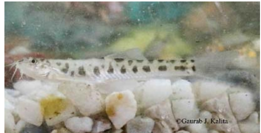
Fig 32: Schistura corica