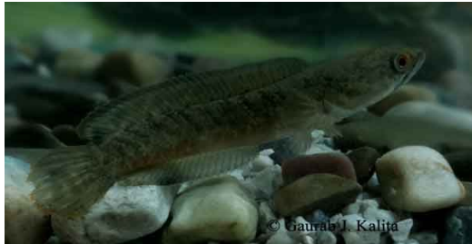
Fig 65: Channa gachua

Species like Schistura corica , Pisodonophis boro , Garra nasuta , Osteobrama cotio , Badis assamensis and Glossogobius gutum very rarely reported in lower parts of Assam. While Amblypharyngodon mola Barilius barna , Barilius bendelisis , Barilius vagra , Barilius barila , Danio dangila , Garra gotyla , Puntius conchonius , Puntius sophore , Puntius ticto Lepidocephalichthys guntea , Mystus vittatus , Clarias batrachus , Heteropneustes fossilis , Aplocheilichthys panchax , Macrornathus aral , Macrornathus pancalus , Channa gachua and Channa punctatus are mostly found in Manas national park and its adjacent villages. Due to inadequacy of previous information on ichthyofaunal diversity from Manas national park and its adjoining villages it is not possible to appraise the rate of decline in ichthyofaunal diversity, but the present study would be useful as criterion data for any future appraisal after interlinking.