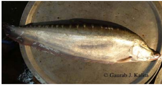
Fig 2: Chitala chitala