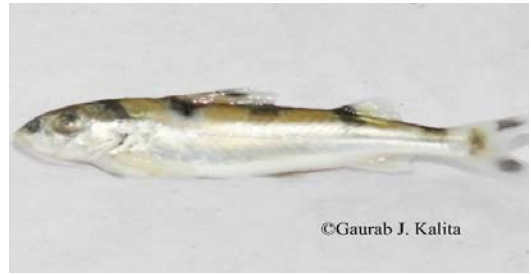
Fig 45: Gagata cenia