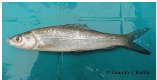
Fig 22: Labeo gonius