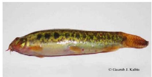
Fig 35: Lepidocephalichthys guntea