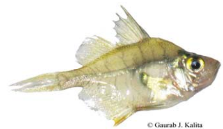
Fig 56: Parambassis baculis