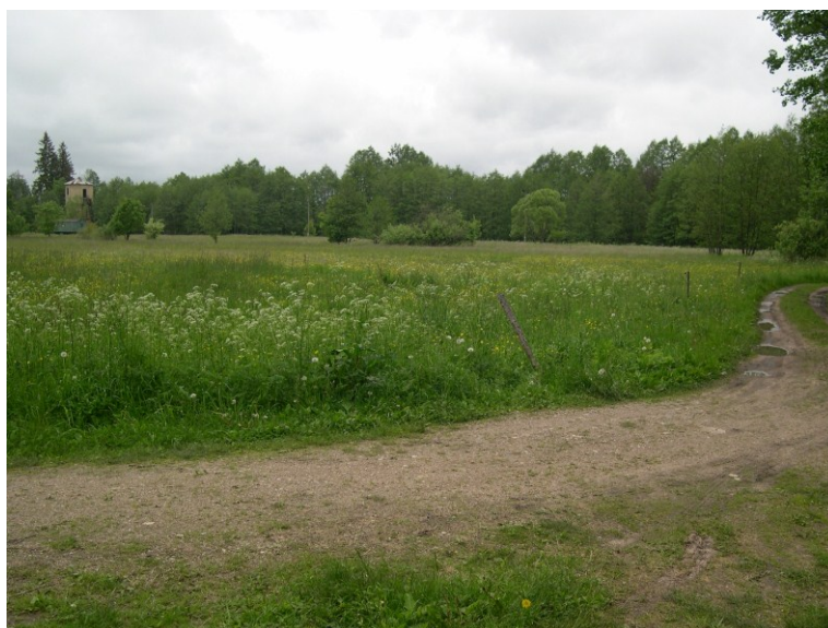
Fig. 5. The habitat of Monopis bisonella sp. n. and the other species presented in this paper (Podolany near Białowieża).