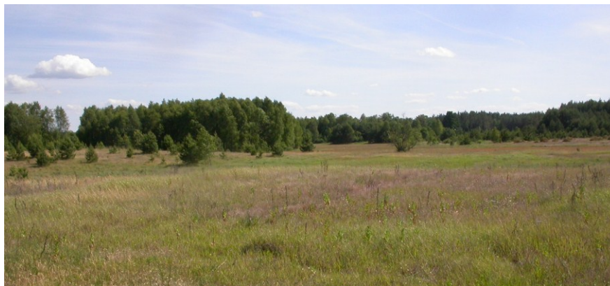
Fig. 6. The habitat of the most interesting species presented: Plaska .