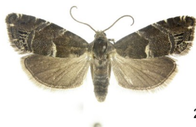
Figs 15-21. Voucher specimens of some significant records: 15. Cnephasia pasiuana ; 16. Dichrorampha incognitana ; 17. Dichrorampha agilana ; 18. Epermenia falciiformis ; 19. Ptocheuusa inopella ; 20. Sophronia chilonella ; 21. Cydia coniferana .