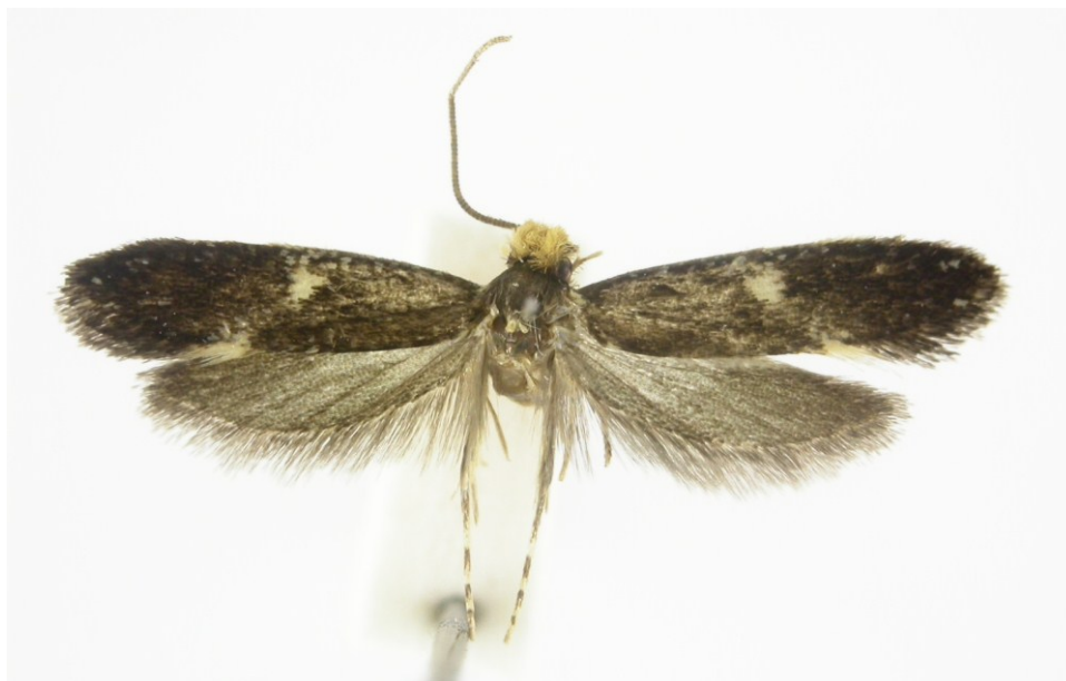
Fig. 1. Holotype of Monopis bisonella sp. n.

Holotype: male, Białowieża env., Podolany village, (genitalia in glycerine in the plastic tube on the pins below the adult) (Fig. 1), 28 V 2000 (leg., coll. J. Šumpich, later in Czech museum with author's collection).