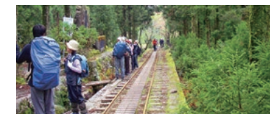
Climbing trail (former tram route for logging)