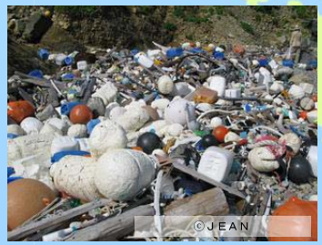
Marine debris (Ohkushi Coast, Nagasaki pref.)