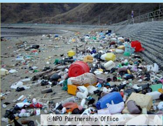
Massive marine debris (Tsuruoka, Yamagata pref.)