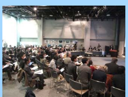
Reporting Forum (Sendai, Miyagi Prefecture)

In August 2012, the first meeting of NGOs in the U.S. and Japan was held to discuss tsunami driftage issues. The participants consists of 9 individuals from Japan including JEAN members, , 10 from the U.S., including the coordinators of the International Coastal Cleanup (ICC) of Alaska, Washington, Oregon, California and Hawaii, an NGO based in Washington D.C., the State Department, and NOAA.