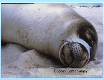
Hawaiian Monk Seal trapped with plastic ring

This Committee is also in charge of planning how to use grants from the government of Japan.