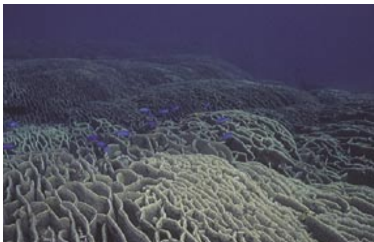
Photo. 1. Large community of Pavona decussate at Minokoshi Bay in Tatsukushi, Tosashimizu, Kochi Prefecture.

When the major damage by A. planci ended around 1990, coral predation by coral-eating gastropods, mainly Drupella fragum , started to be reported. Extermination programs have been carried out by local authorities, the prefectural government, the Ministry of the Environment, and volunteers (Suga 1994; Tominaga 1998). No comprehensive statistical data exist because these programs have been undertaken by many organizations and people, but the number of exterminated individuals peaked at about 100,000–200,000 per year during