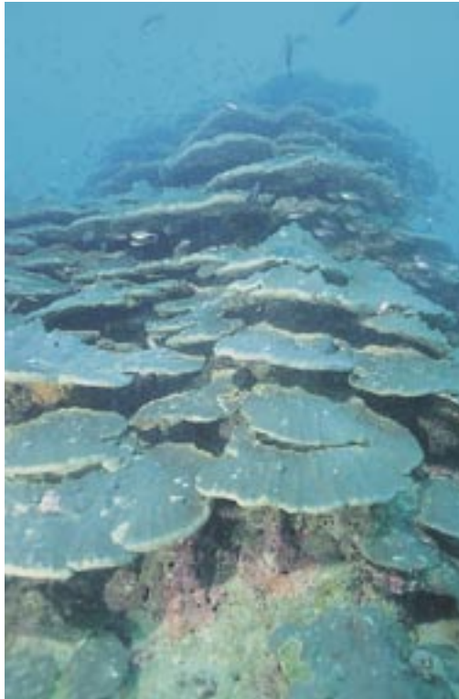
Photo. 1. A large colony of Porites heronensis (about 7 m in height and 6-8 m in width) in the inner bay on the west coast of Oshima (Is.).