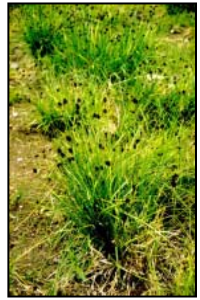
Figure 55. Growth habit of Carex macloviana in cultivation.