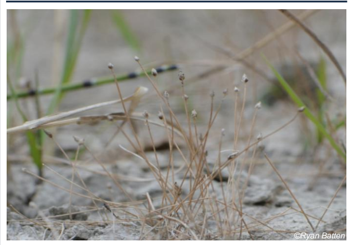
Figure 2 Late season senescing plants in drainage channel