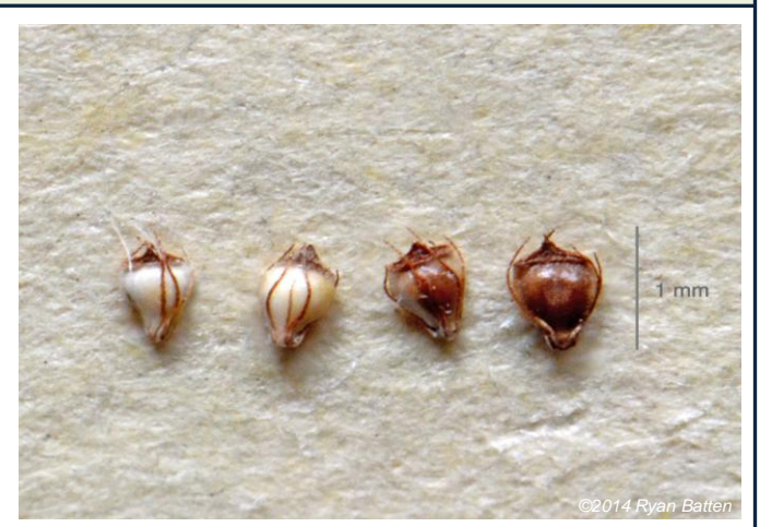
Figure 6 Eleocharis engelmannii achenes showing colour variation