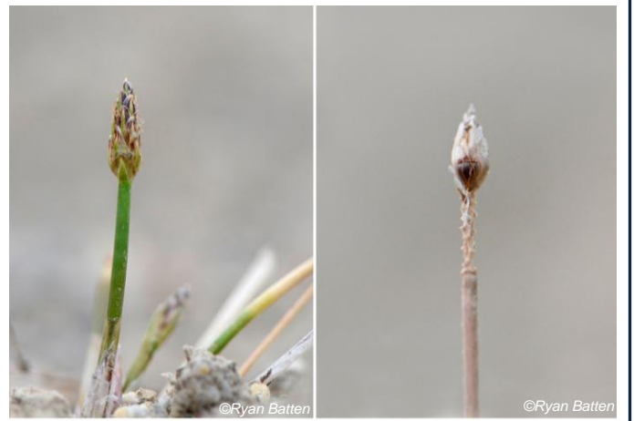
Figure 3 Early and late season spikelets of Eleocharis engelmannii