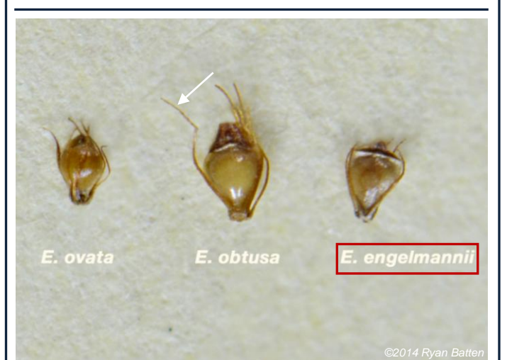
Figure 5 Comparison of mature Eleocharis achenes showing perianth bristles (arrow)