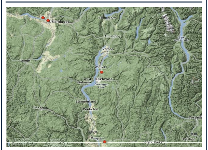
Figure 1 B.C. distribution of Eleocharis engelmannii (adapted from BC CDC 2014)