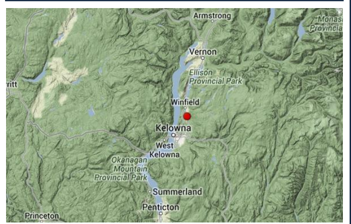
Figure 1 B.C. distribution of L. dubia var. dubia (BC CDC 2013)