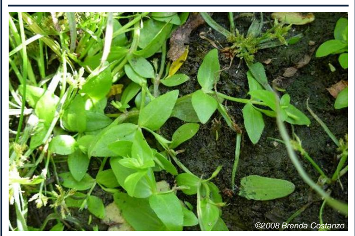
Figure 2 Open fine-textured substrate at Ellison Lake, B.C.