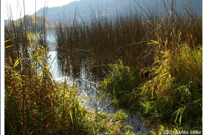
Figure 3 Flooded lakeshore habitat at Ellison Lake, B.C.

Figure 2 Open fine-textured substrate at Ellison Lake, B.C.