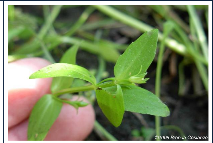
Figure 6 Close up of plant showing leaves and calyx