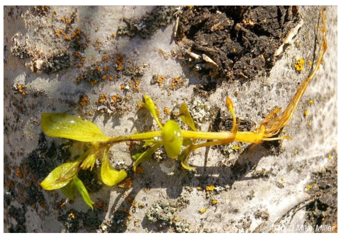
Figure 5 Plant showing fibrous roots and paired ovate leaves

Elliptical capsules, 4 to 6 mm long, each containing numerous tiny, pale yellow, finely net-veined seeds