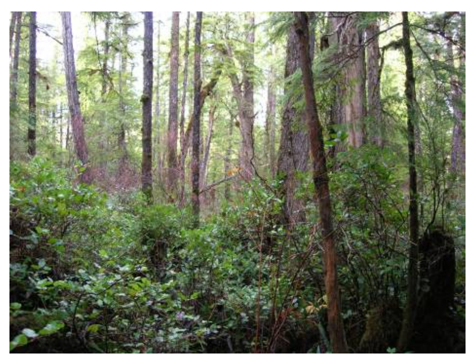
Figure 3. Western redcedar/western hemlock old-growth forest inland from Pacific Rim National Park Reserve, within provincial Crown land. The region surrounding the park is heavily logged and remnant patches of old growth are important refuges for Dromedary Jumping-slug.

Microhabitat characteristics for Dromedary Jumping-slug include abundant coarse woody debris, from large-diameter pieces to a forest floor composed of thin, compact needle litter thought to provide suitable microhabitats for shelter from predators and environmental fluctuations, egg laying, hibernation, aestivation, and feeding. Mossy areas and decaying logs retain moisture and provide essential shelter during warm and dry weather conditions. It is important for Dromedary Jumping-slug to have a suitable resting site from which moisture can be absorbed through the foot; contact re-hydration is crucial for survival (Prior 1985). As observed in other terrestrial slugs and snails, large diameter, damp rotten logs may act as dispersal corridors and shelter during seasonal drought (Applegarth, unknown date).