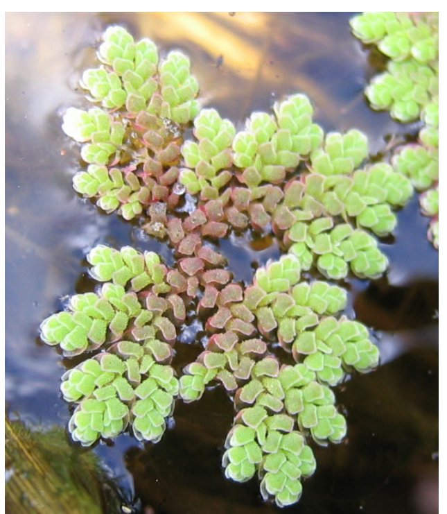
Figure 1. Mexican mosquito fern, Little Fort, BC.

In spite of several taxonomic treatments of Azolla species, taxonomy and identification are generally considered difficult (Moore 1969; Pereira et al. 2001; Evrard and Van Hove 2004; A. Ceska, pers. comm., 2005). Pereira et al. (2001) indicate that many previously described diagnostic vegetative and reproductive characters are environmentally influenced and vary with the collection site.