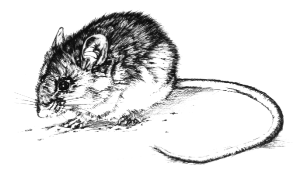
Figure 1: Smoky Mouse. Black and white illustration is approximately half actual size of the mouse.

Variability in size and colour has been noted between two forms found in Victoria. The western form, known only from the Grampians, is larger and darker than the eastern form (east of Melbourne) (Cockburn 1995). It appears that the specimens found in NSW are similar to the eastern form and a male trapped in the Brindabella Ranges had a pink scrotum (Osborne and Preece 1986), whereas those from the Grampians were darkly pigmented (Cockburn pers. comm.).