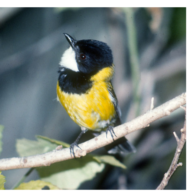
Lord Howe Golden Whistler ( Pachycephala pectoralis contempta )