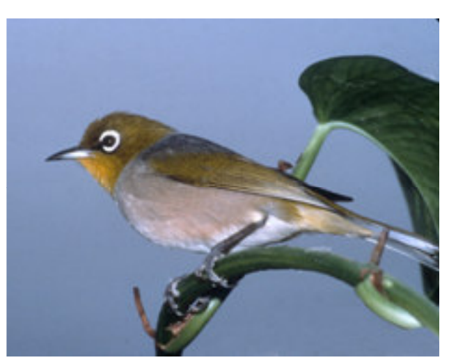
Lord Howe White-ey e (Zosterops tephropleura)

Hutton, I. 1991. Birds of Lord Howe Island: Past and Present. Hutton, Coffs Harbour.