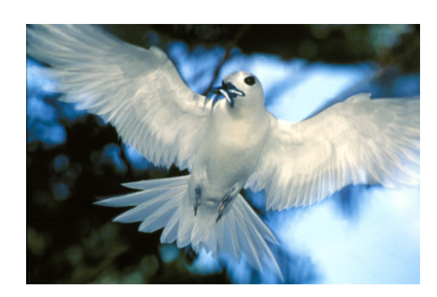
White Tern (Gygis alba)