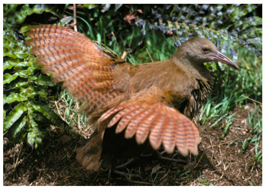
Lord Howe Woodhen (Tricholimnas sylvestri)