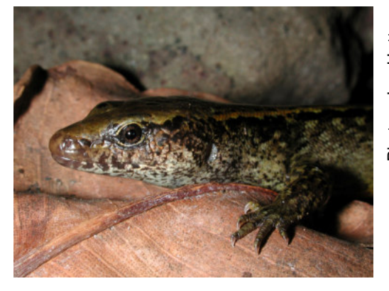
Lord Howe Island Skink (Cyclodina lichenigera)

Cogger, H. G. 2004. Draft Recovery Plan for the threatened lizards Christinus guentheri and Oligosoma lichenigera on the island complexes of Norfolk and Lord Howe Islands. Department of Environment and Heritage, Canberra.