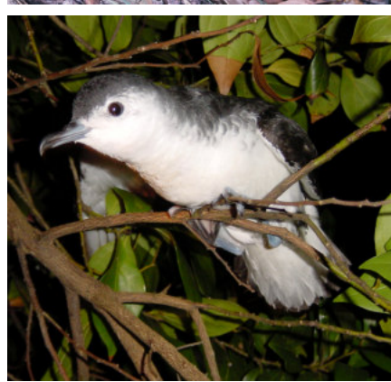
Black-winged Petrel (Pterodroma nigripennis)