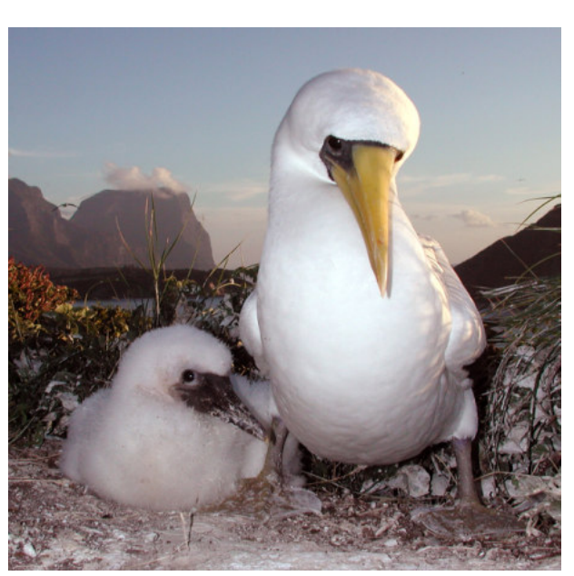
Masked Booby (Sula dactylatra fullageri)