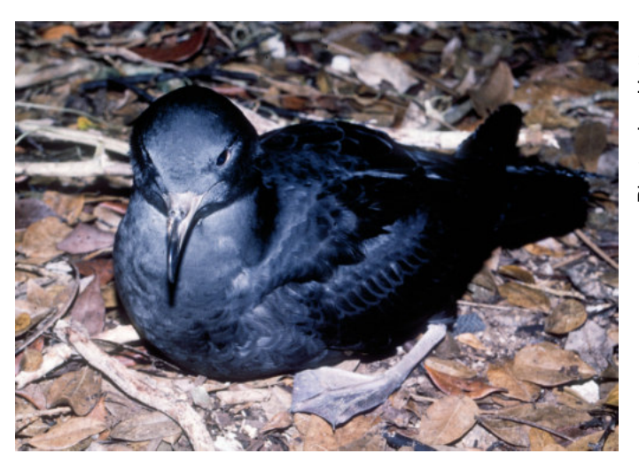
Flesh-footed Shearwater (Puffinus carneipes)