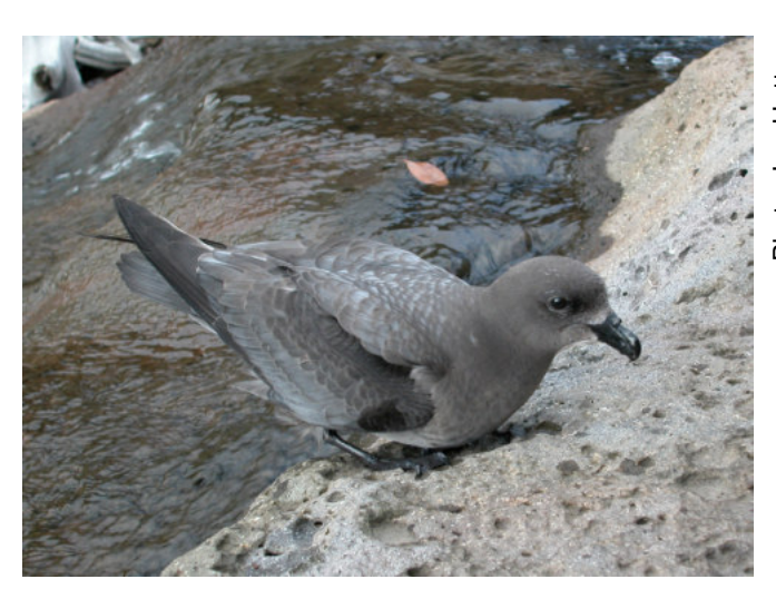
Providence Petrel (Pterodroma solandri)