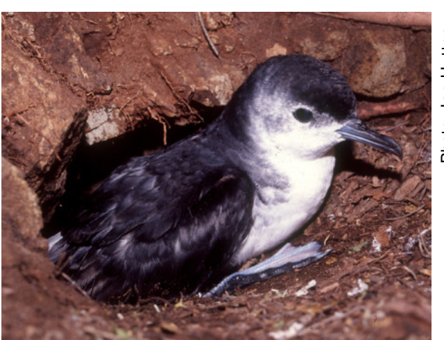
Little Shearwater (Puffinus assimilis)