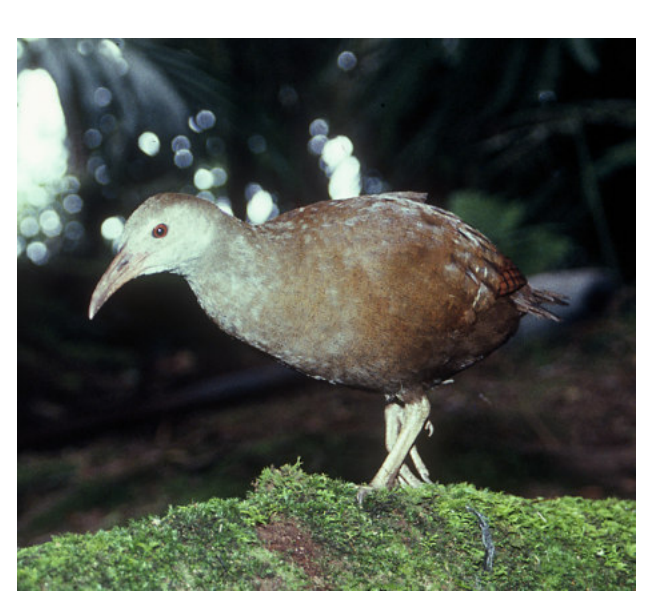
Lord Howe Woodhen (Tricholimnas sylvestris)