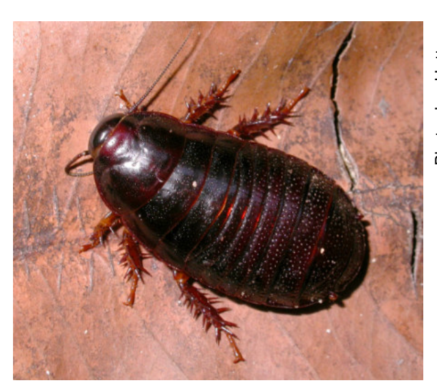
LHI bush cockroach (Panesthia lata)

NSW Scientific Committee 2003. Nomination for Listing Panesthia lata as an endangered species.