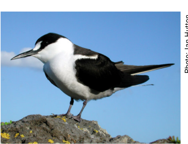
Sooty Tern (Sterna fuscata)