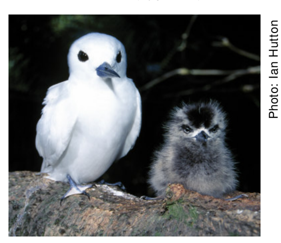
White Tern (Gygis alba)