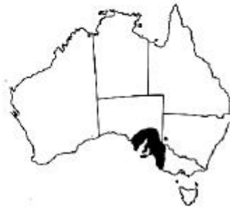
Figure 3. The distribution of Neobatrachus pictus . (Adapted from Cogger 1992 and Ayers et al. 1996).

N. pictus has not been recorded from Tarawi Nature Reserve in south-western NSW or from Dangali Conservation Park in South Australia, which is also adjacent to Scotia Sanctuary. The closest confirmed N. pictus records (identified by the South Australian Museum from voucher specimens) in South Australia are from 34 km west of Dangali Conservation Park and from around Renmark.