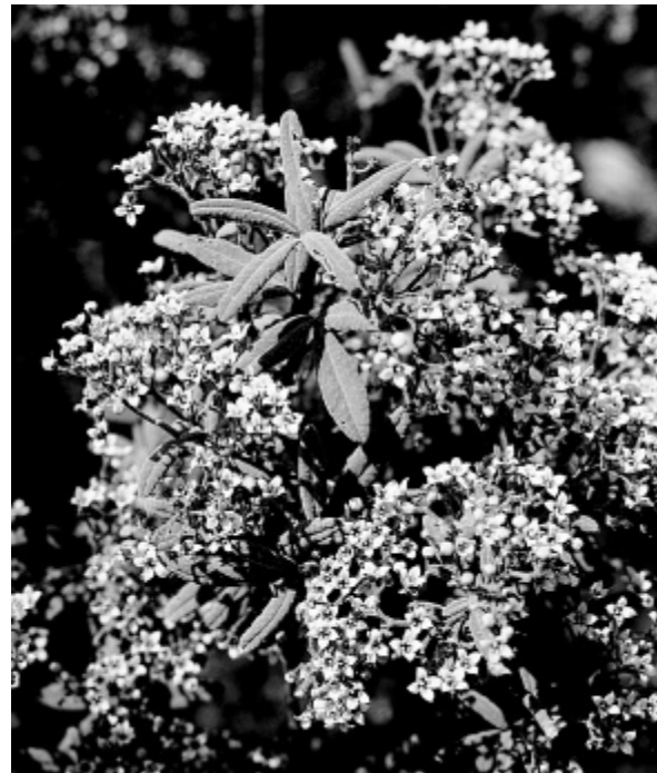
Figure 1. Zieria formosa

appearance. The upper surface is covered with numerous small warts (tubercles) whilst the lower surface is sparsely warty. The flowers are pale pink and are arranged in large, 26-45 flowered clusters. The flower clusters arise from the leaf axils near the ends of the branchlets and protrude slightly beyond the leaves. Individual flowers are about 6-9 mm across with four obovate petals. Flowering occurs in September-October. The fruit is a four chambered capsule about 5 mm across. Each chamber contains one or rarely two elliptical dark-brown seeds 2-2.5 mm long. See Figure 1 for photograph of flowering branchlet.