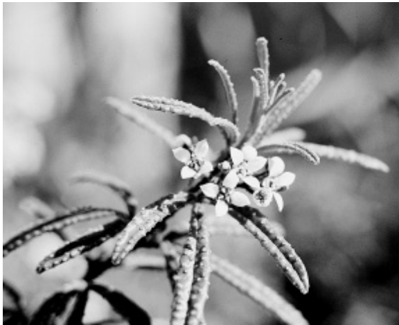
Figure 2. Zieria parrisiae

Zieria parrisiae is a bushy shrub growing to 4.2 m in height. The leaves are arranged in clusters of three leaflets (trifoliolate) on a common stalk, with the leaf clusters occurring in opposite pairs long the branchlets. The leaves are strongly aromatic when crushed, and the young stems and both surfaces of the leaf are covered with a moderately dense, layer of short stellate (star-shaped) hairs and numerous conspicuous warts (tubercles). The leaf edges are slightly toothed