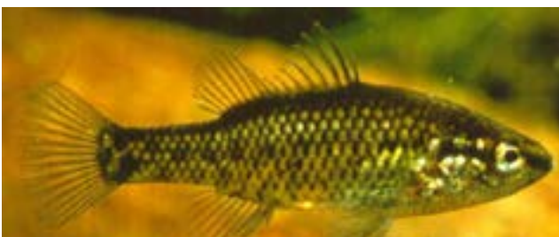
Yarra Pygmy Perch (DELWP)

The Yarra Pygmy Perch typically occurs in slow-flowing or still waters that possess large amounts of aquatic vegetation (particularly emergent vegetation) such as lakes, ponds and slow-flowing rivers (Kuitert et al. 1996; Woodward & Malone 2002). Yarra Pygmy Perch are usually found in small groups and often co-occur with the southern pygmy perch ( Nannoperca australis ), although the former appears to prefer slightly stronger flows (Kuitert et al. 1996). Where cohabitation occurs, Yarra Pygmy Perch are often restricted to shallow habitat adjacent to the stream margins due to competition with southern pygmy perch for habitat and space (Woodward and Malone 2002).