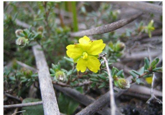
Dergholm Guinea-flower

It is estimated that 200 individuals exist. These plants occur in four populations. The extent of range and abundance of Dergholm Guinea-flower prior to European settlement is unknown.