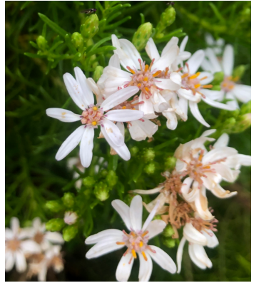
EVC 1 EVC 858