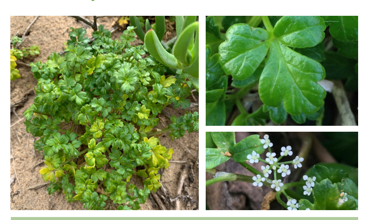
EVC 1 Coastal Dune Scrub/Coastal Dune Grassland Mosaic