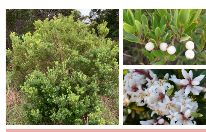
EVC 1 Coastal Dune Scrub/Coastal Dune Grassland Mosaic EVC 858 Coastal Alkaline Scrub (Calcarenite Dune Woodland)