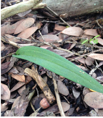
EVC 1 EVC 858

Coastal Dune Scrub/Coastal Dune Grassland Mosaic Coastal Alkaline Scrub (Calcarenite Dune Woodland)