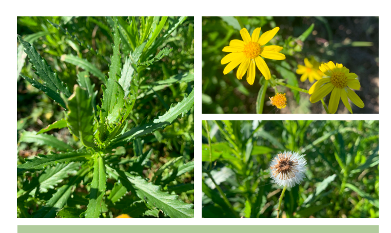
EVC 1 Coastal Dune Scrub/Coastal Dune Grassland Mosaic