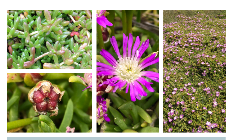
EVC 1 Coastal Dune Scrub/Coastal Dune Grassland Mosaic EVC 9 Coastal Saltmarsh