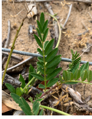
EVC 1 Coastal Dune Scrub/Coastal Dune Grassland Mosaic EVC 858 Coastal Alkaline Scrub (Calcarenite Dune Woodland)