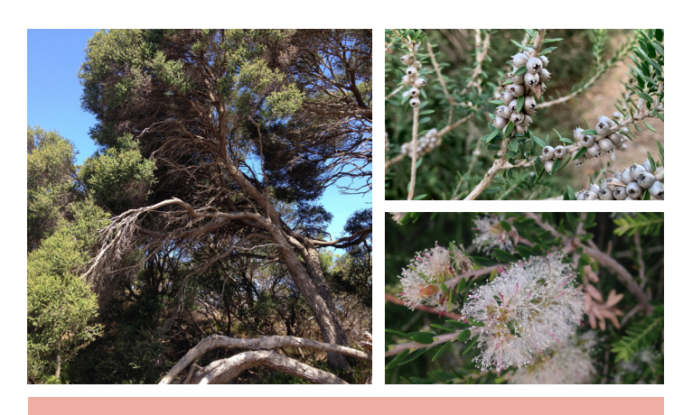
EVC 858 Coastal Alkaline Scrub (Calcarenite Dune Woodland)