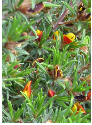
EVC 1 EVC 858

Coastal Dune Scrub/Coastal Dune Grassland Mosaic Coastal Alkaline Scrub (Calcarenite Dune Woodland)