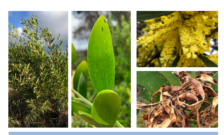
EVC 1 Coastal Dune Scrub/Coastal Dune Grassland Mosaic