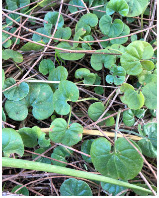
EVC 1 EVC 858

Coastal Dune Scrub/Coastal Dune Grassland Mosaic Coastal Alkaline Scrub (Calcarenite Dune Woodland)