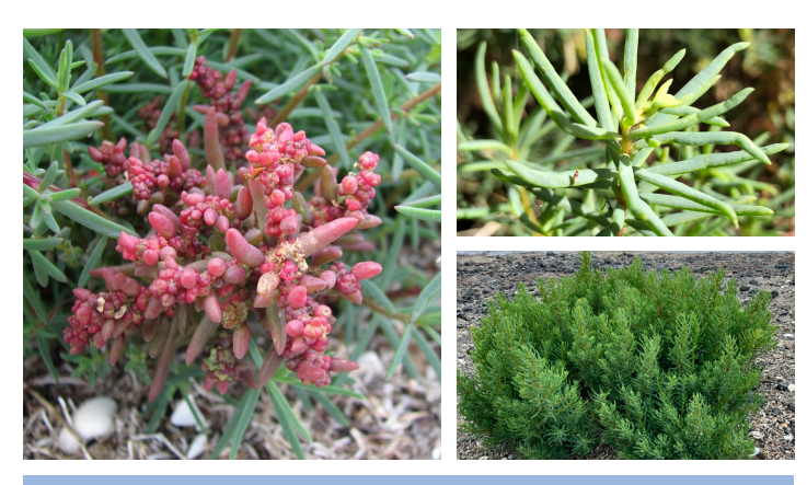
EVC 1 Coastal Dune Scrub/Coastal Dune Grassland Mosaic EVC 9 Coastal Saltmarsh