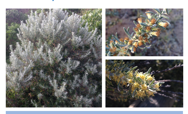
EVC 1 Coastal Dune Scrub/Coastal Dune Grassland Mosaic