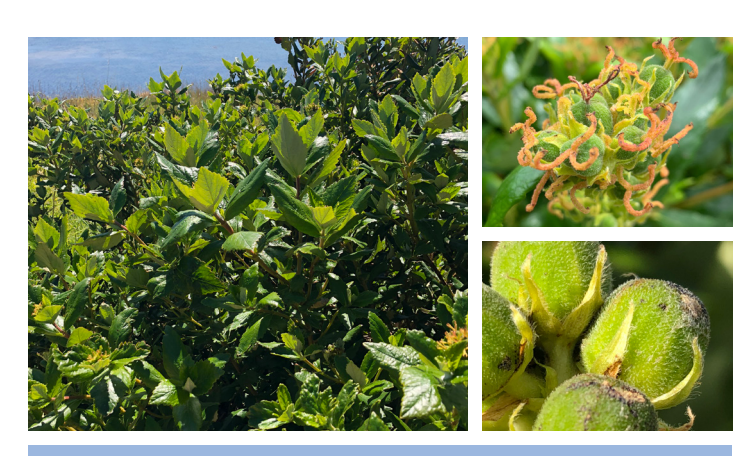
EVC 858 Coastal Alkaline Scrub (Calcarenite Dune Woodland)