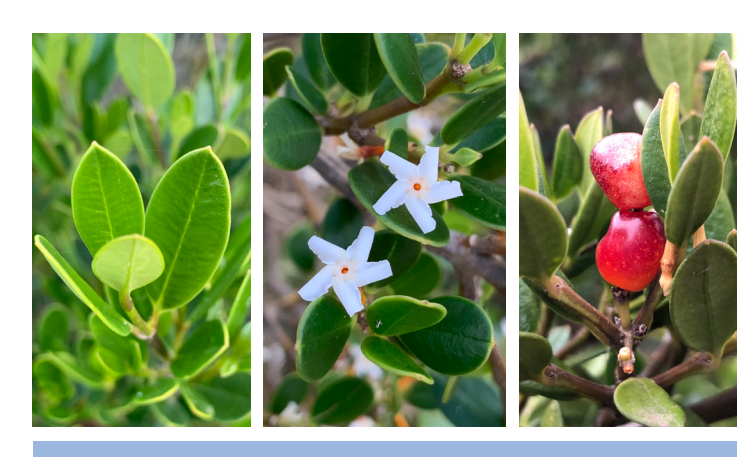
EVC 1 Coastal Dune Scrub/Coastal Dune Grassland Mosaic