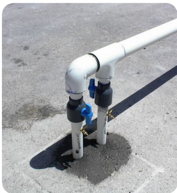
Pipes transport vapors from the underground SVE extraction well to treatment.

SVE and air sparging are efficient ways to remove VOCs above and below the water table. Both methods can help clean up contamination under buildings, and cause little disruption to nearby activities when in full operation. SVE and air sparging are often used together. SVE and air sparging are being used or have been selected for use at approximately 285 and 80 Superfund sites, respectively.