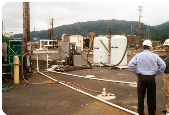
Above-ground treatment system includes two tanks of activated carbon.