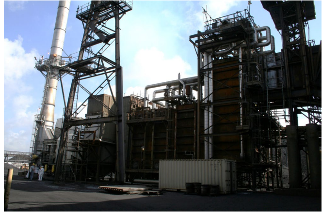
Waste Heat Boiler, Unit 4

A heat recovery boiler/steam turbine WHP project at a petroleum coke plant in Port Arthur, Texas, recovers energy from 2,000 °F exhaust from three petroleum-coke calcining kilns. The project produces 450,000 pounds/hour of steam for process use at an adjacent refinery and 5 MW of power. The project creates an estimated 159,000 tons per year of carbon dioxide emissions savings.