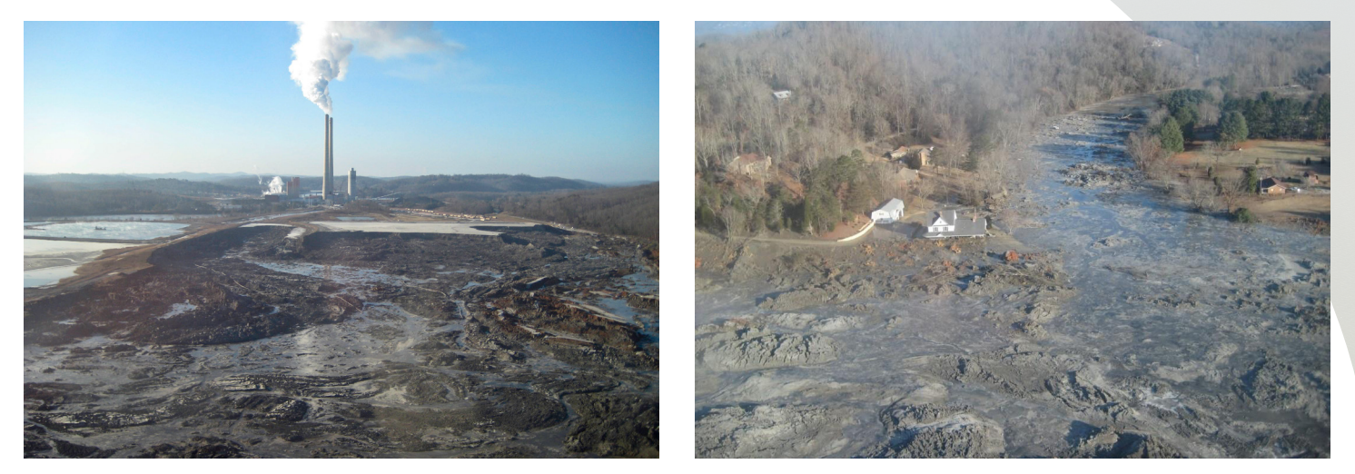
Figure 3. Remaining ash in cell where the breach occurred in 2008 (left). Flow of ash into the Emory River from the breach (right).

River flows were managed by controlling nearby dams. Ash migration was controlled by constructing a weir, or low dam - Weir #1, across the Emory River and Dike #2 across the embayment, see Figure 4. Damaged railroads, roads and utilities, including gas lines and waterlines, were repaired. Floating ash residue (cenospheres) and debris from the river systems were collected. TVA installed stormwater management systems, dust control systems and dike stabilization. Community outreach provided for safety and housing of affected residents.