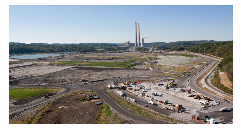
Figure 5. Dredging during cleanup.

Phase 2 involved mechanical excavation of about 2.3 million cubic yards of ash in the north and middle Swan Pond Embayments (see Figures 4 and 5). Recovered ash was dried to optimum moisture content, spread into thin lifts and compacted on site in a 240-acre disposal cell. The disposal cell was re-engineered with a 12-mile subsurface stabilization slurry wall. It is the largest slurry wall in the United States. Most Phase 2 activities were finished by December 2014.