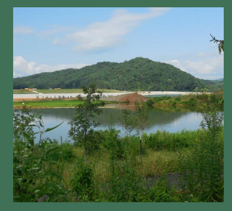
Riparian Zone Plantings Reduce nutrient runoff and provide shade and habitat for creatures living on land and in water.