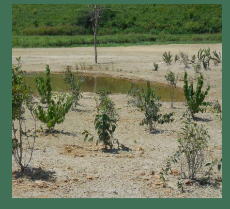
Vernal Pools Provide areas for amphibians to live and breed.