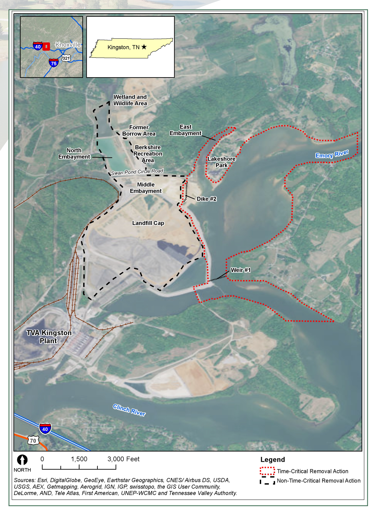
Figure 4: Site Map