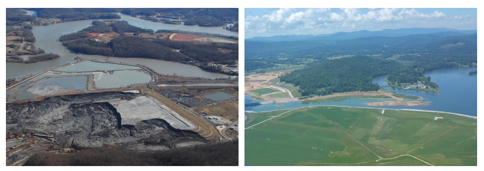
Figure 1. Aerial view of the coal ash spill in 2008 (left). Capped landfill and recreation area at the site in 2015 (right).

Today, less than a decade later, the site is home to a 240-acre capped landfill, Roane County's Swan Pond Recreation Area and Lakeshore Park, see Figure 1. Natural areas at the site provide an interconnected ecosystem that supports diverse wildlife habitat and recreation opportunities.