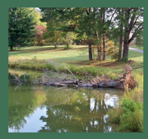
Fish Attractors Provide preferred fish habitat.