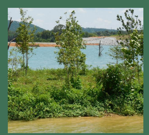
Reforestation Reduces erosion, provides valuable habitat and reduces nutrient runoff.