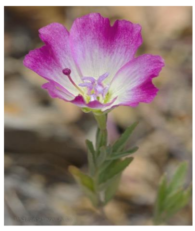
The Pismo clarkia © Aaron Schusteff. Artist's permission

In the FWS's 2009 five-year status review on the species, as required by Section 4(c)(2) of the ESA, there were 14 populations of the Pismo clarkia presumed to be extant. (See Figures 1 and 2 to cross-reference populations with the aquifer exemption area.) Since the flower's listing in 1994, it is known that at least five populations of the species have been extirpated. As required by the ESA, the FWS is undertaking the next five-year status review of the endangered flower, initiated in 2013. Overall, FWS has concluded that the priority to recover the Pismo clarkia is very high, as the subspecies faces a high degree of threat.