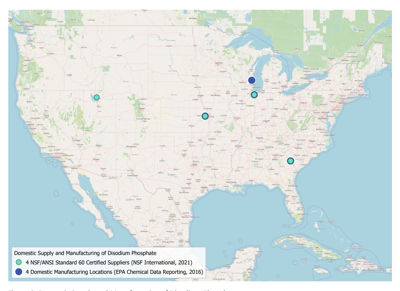
Figure 2. Domestic Supply and Manufacturing of Disodium Phosphate