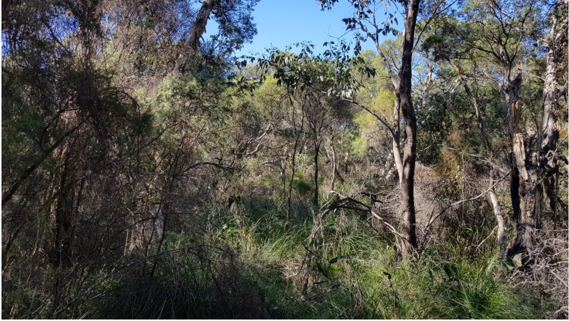
Figure 3 Potential habitat searched on Lot 160