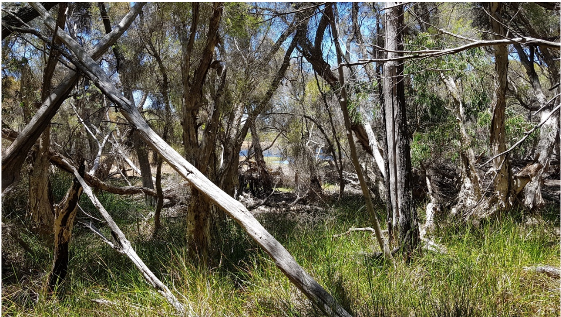
Figure 4 Potential habitat searched on Lot 101