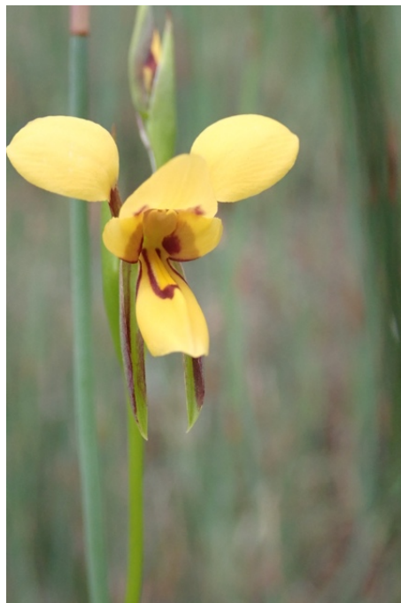
Figure 1. Diuris drummondii photographed during an Ecoedge survey in Capel, 2018.

Diuris drummondii is listed as Vulnerable under both the State Biodiversity Conservation Act 2016 and the Commonwealth Environment Protection and Biodiversity Conservation Act 1999 . D. drummondii is found in low-lying depressions in peaty and sandy clay swamps (DEWHA, 2008). The optimum survey time for the orchid is from November to January when the tall (up to 1 m high) yellow-flowering orchid is in bloom Figure 1 .