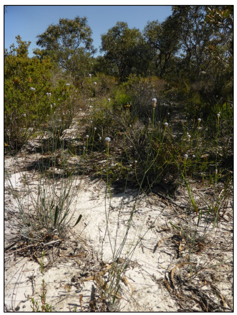
Plate 1. Conospermum scaposum.