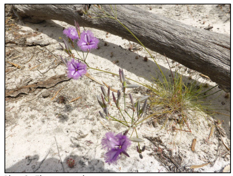
Plate 2. Thysanotus glaucus.