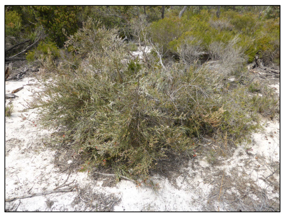
Plate 3. Jacksonia aff. floribunda shrub.