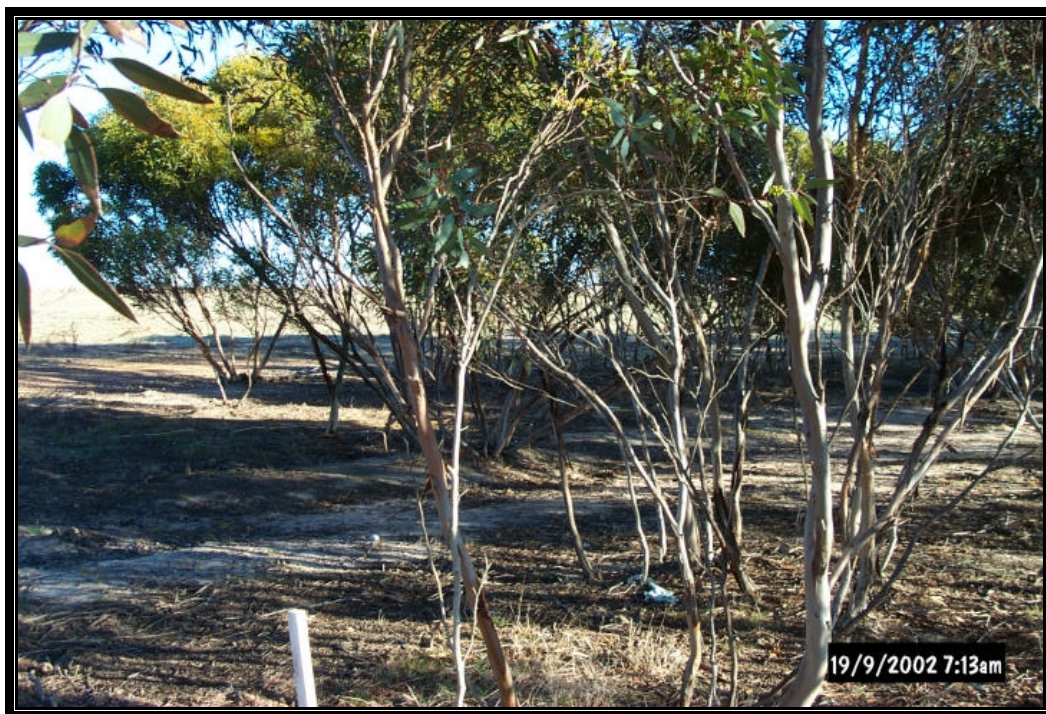
Plate 1. Plot TRL1 located on the Myamba farm.

The plot was dissected by a shallow creek bed with sandy white alluvial material in the lower areas ( Plate 1 ). In the higher areas the soil was a clay, with a high organic matter content. There was a significant amount of litter present, suggesting relatively high plant productivity and good soil quality.