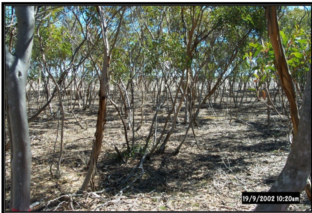
Plate 4. Plot Trilogy 4, located on Myamba farm, showing dense vegetation, and high plant crown cover.

The soil at this site consisted of a light brown clay, and was very compacted at a depth of 2cm.