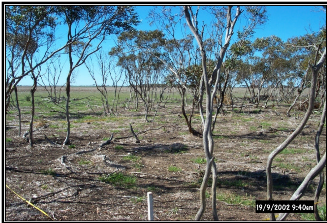
Plate 3. Trilogy plot 3 located on the Myamba farm, showing sparse vegetation cover and density.

This plot was located close to the farm dam, with trees close to the dam appear to be stressed or dying. Soils in the area were dark grey/brown loams.