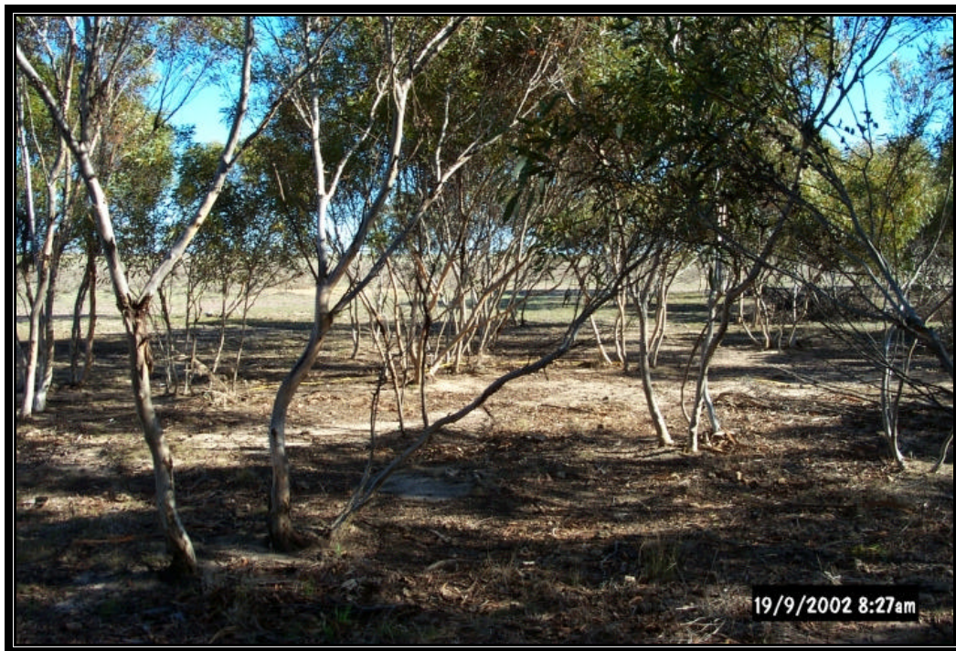
Plate 2. Plot TRL2 located on the Myamba farm.

The soil at this site was organic grey clay. There were no weed species noted at this site.