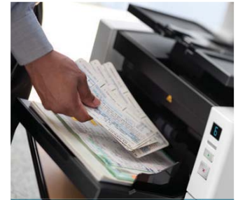
SurePath Paper Handling automatically adjusts for a variety of document sizes and thicknesses.

Optional Kodak Legal Size and A3 Size Flatbed Accessories for added capability to scan bound, oversized and fragile documents.