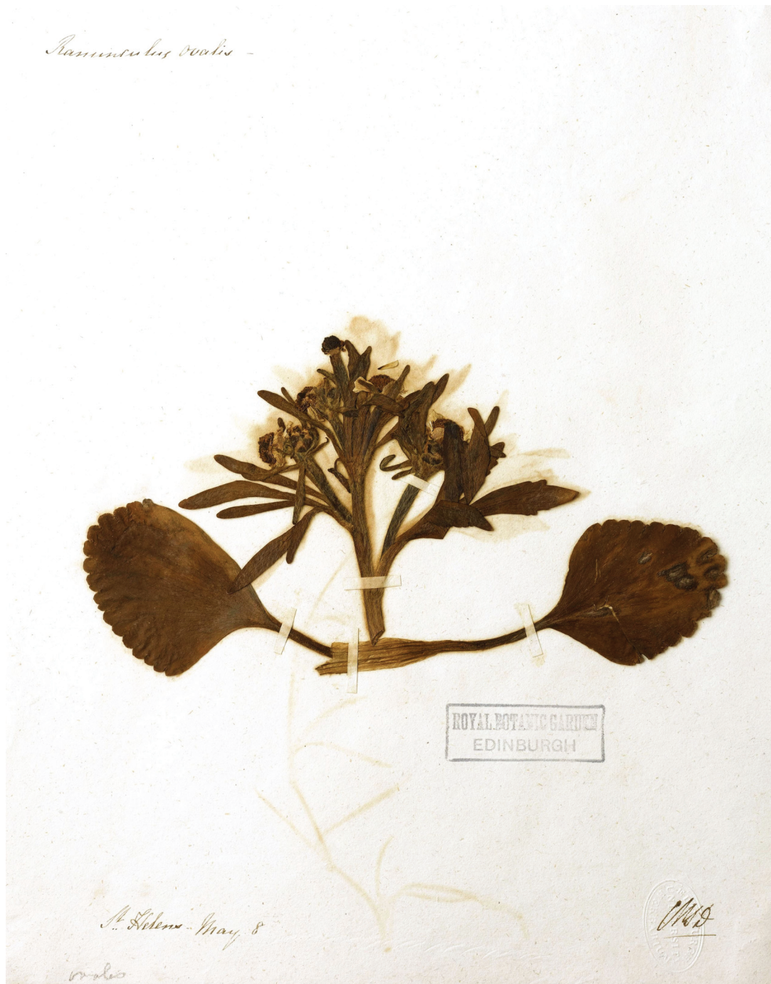
Figure 1: Ranunculus rhomboideus , (prairie buttercup), found in herbarium of Christian Ramsay, Lady Dalhousie, and collected on Île Ste-Hélène, May 8, [? 1824], new to Quebec then, but now extirpated.