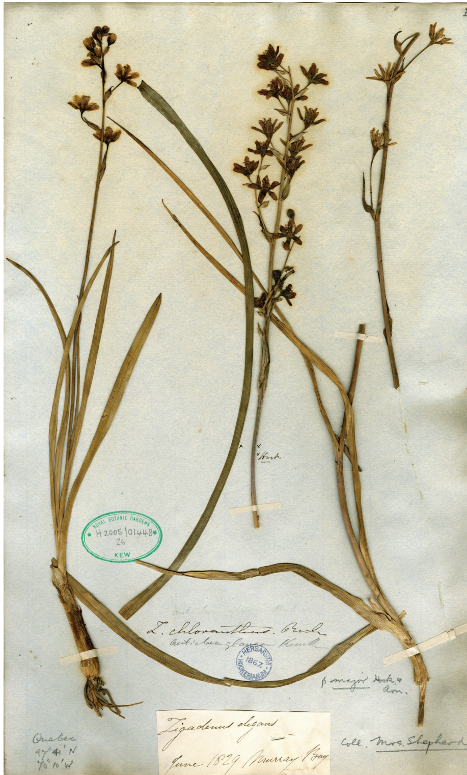
Figure 3: Zigadenus elegans (now Anticlea elegans , mountain death camas), collected by Harriet Sheppard, June 1829, at Murray Bay. Herbarium of the Royal Botanic Gardens, Kew; photo AAFC.