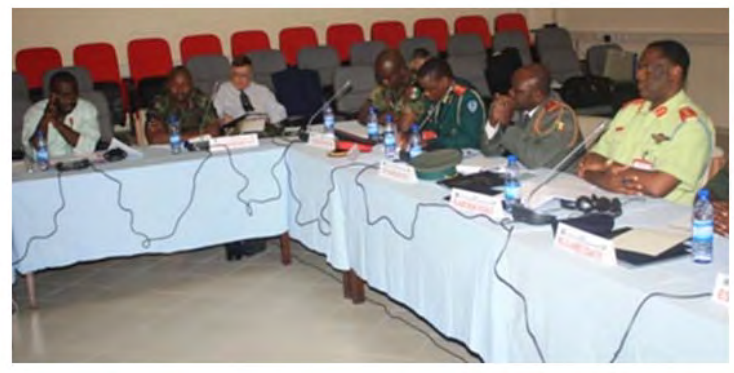
JSOU Ghana Continuing Engagement MET

• In April 2009, a colonel from South Sudan attended one of CCMR's Monterey programs and became an active participant in the class. He returned to Juba, and immediately called his staff together. Waving the CCMR CTFP course book, he told them that they needed to develop a CbT strategy, as he learned to do in Monterey. In FY10, CCMR will send a team to conduct a "Strategy Workshop" in Juba to help the Sudan Peoples Liberation Army (SPLA) assemble that strategy.