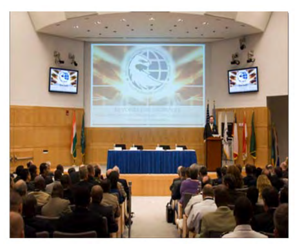
CISA Beyond the Horizon Conference at Lincoln Hall

foreign military officers (O-5 to O-8) and civilian government equivalents from partner nations. The Philippine Secretary of National Defense spoke (at his request) and brought 30 additional senior Filipino officials to the conference. Many of the working group sessions were led by CISA graduates (CT Fellows), who demonstrated substantial expertise and application of principles learned while attending CISA. In addition to building relations among the CT Fellows, representatives from various U.S. Government agencies and departments (Joint Professional Military Education (JPME) institutions, SOLIC&IC, USSOUTHCOM, the Joint Improvised Explosive Device Defeat Organization (JIEDDO), the Defense Advanced Research Projects Agency (DARPA) and the U.S. Department of State (DOS)) were able to engage with the international alumni.