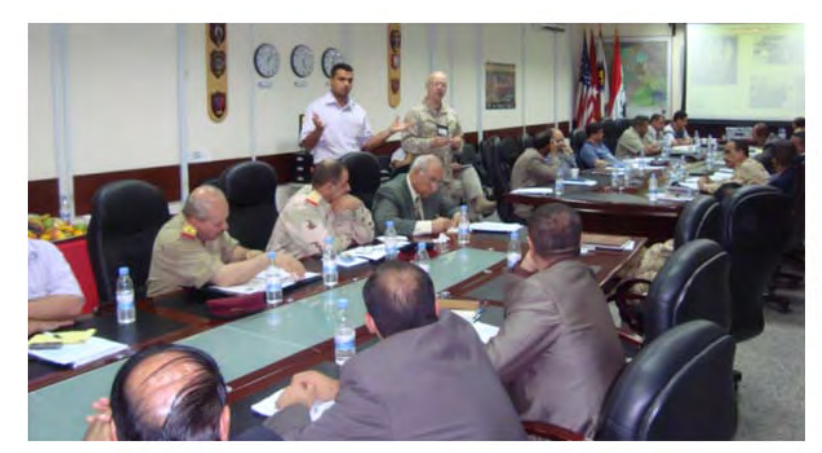
DIILS Iraq MET