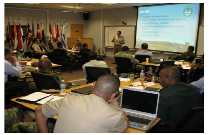
A JSOU SOCbT student presenting his team's final project