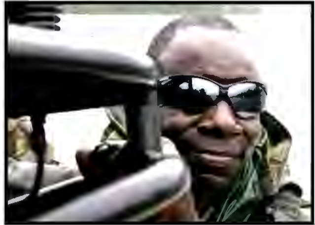
South Sudanese student during the SLSCCbT.

NAVSCIATTS for Senior International Leaders. The four week in-resident COI is designed to educate senior officers or civilian equivalent partner nation leaders on strategic theory of standing up, leading and operating a small craft unit employed to combat terrorism. The first SLSCCbT took place in New Orleans, Louisiana June 15–July 15, 2010, with participants hailing from the Royal Thai Navy, Uganda People’s Defense Force, Ethiopian National Defense Force, and the South Sudanese People's Liberation Army. The first SLSCCbT MTT took place in Sopot, Poland in September 2010.