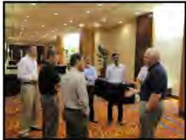
JSOU guided pre-conference discussion.