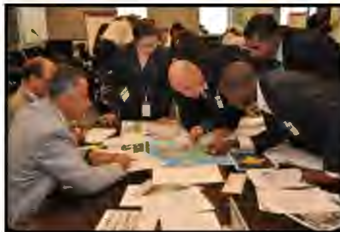
NDU Kick-Off break out group at work.

The week of August 30–September 3, CISA graduates and outside subject matter experts (SMEs) joined with the incoming 2011 class to work through a scenario based on the current conflict in Colombia. The Counter-Insurgency (COIN) and CbT exercise allowed students to play the role of the Colombian government and eight regional Army divisions. CbT SMEs from Colombia participated, assuming the Revolutionary Armed Forces of Colombia (FARC) terrorist group role. Alumni served as mentors for the new students. The week challenged the students in COIN/CbT areas including the balance between security and development, the tension between strategic and operational demands, the importance of intelligence and strategic communications, as well as the impact of corruption and narcotics traffickers.