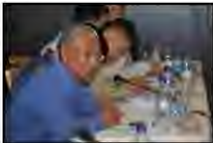
APCSS Alumni posing a question to the panel.

APCSS, the Maldives government, and the Maldives APCSS Alumni Association, the symposium was attended by 67 participants representing seven nations. Attendees included the Maldivian Foreign Minister and the U.S. Ambassador to Sri Lanka & Maldives. The symposium provided a unique opportunity for candid and robust discussions among seasoned CT professionals in South Asia. The event gained national attention, with reporting by the national