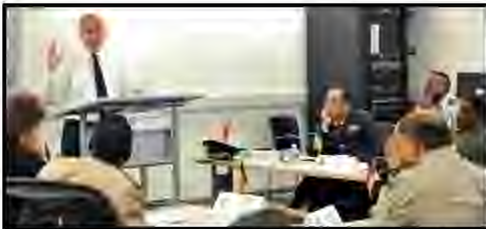
General Hayden served as the keynote speaker for the DIA International Fellows Program.

In FY10, 3,521 foreign military and security officials attended CTFP-funded programs throughout the six regional COCOMs. This included CbT education and training support to emerging regional and sub-regional organizations and alliances. Regional training events are particularly effective in developing personal and professional relationships among security officials from many countries within a given geographic area. Additionally, the CTFP provides a series of globally oriented courses that enhance mutual understanding and facilitate global cooperation.