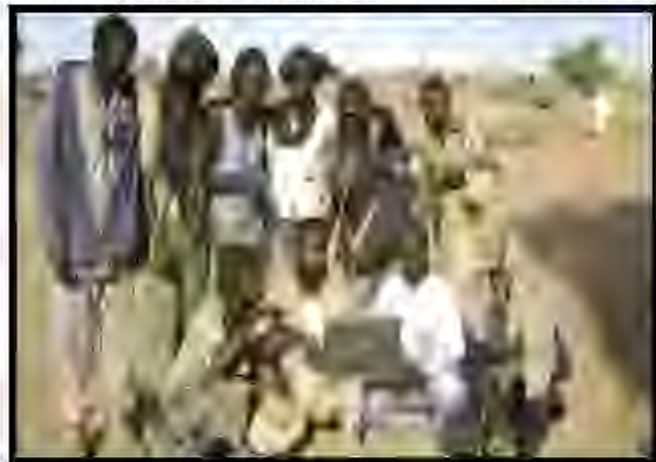
NDU/CISA alumni teaching his CbT knowledge with the South Sudanese.