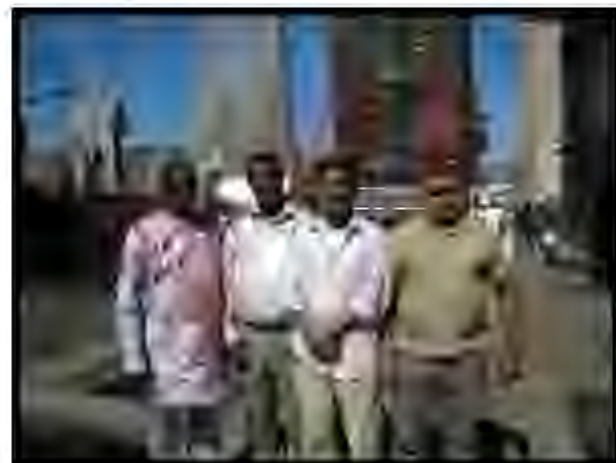
DIA participants at the World Trade Center site.