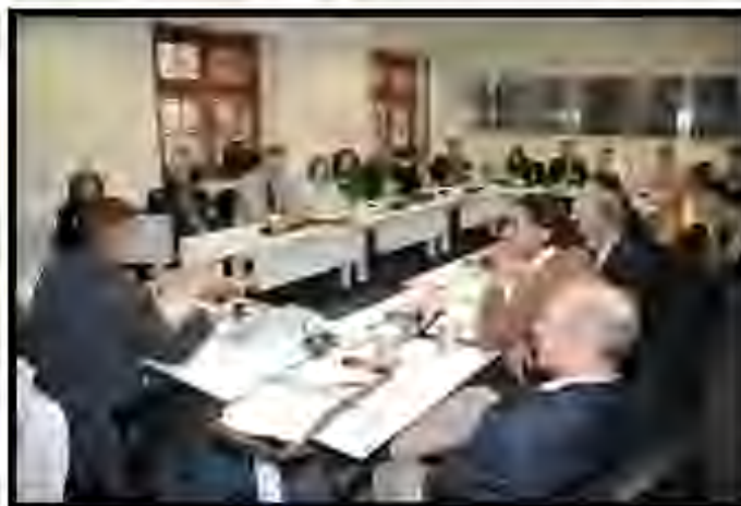
Alumni Staff discussing how to design and implement alumni programs to realize the most value for DoD.

CTFP Alumni Directors and Staff Conference: A great success and the first of its kind, the DoD Alumni Staff Conference was held in conjunction with the Regional Center’s Registrar’s Conference. The five-day conference was held in Garmisch, Germany, November 16-20, 2009.