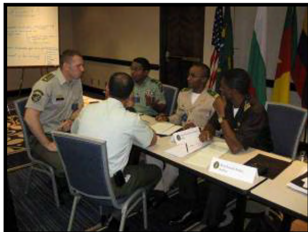
ASOCbT student break-out session group.

With the intent of advancing CbT international partnership networks established during the Special Operations Combating Terrorism Course, JSOU designed the ASOCbT. The course focuses on developing strategies for countering terrorist threats and the importance of education concerning current and emerging global threats. Two iterations of this Tampa based course were conducted in its inaugural year (April 5–9 and September 13–15). Throughout the two courses, thirty alumni from Brazil, Bulgaria, Cameroon, Congo, Colombia, El Salvador, Jordan, Macedonia,