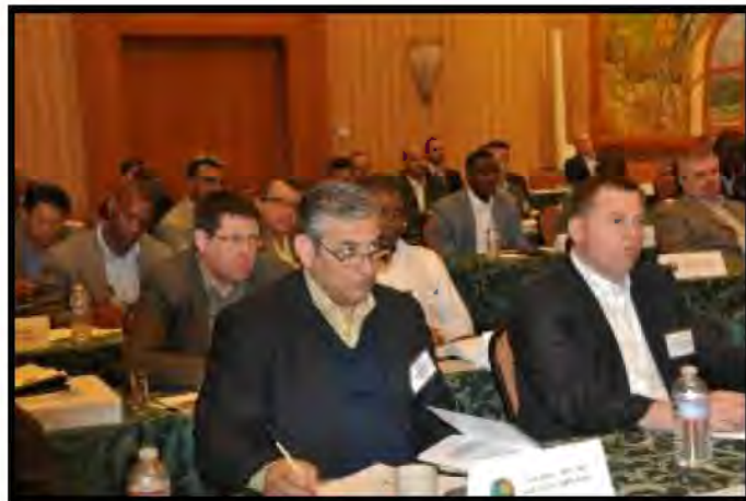
DIA alumni participating at the international intelligence symposium.