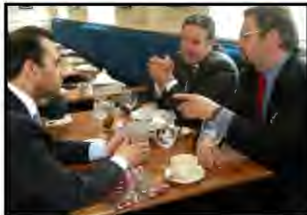
CISA alumnus consulting with NDU/CISA professors.