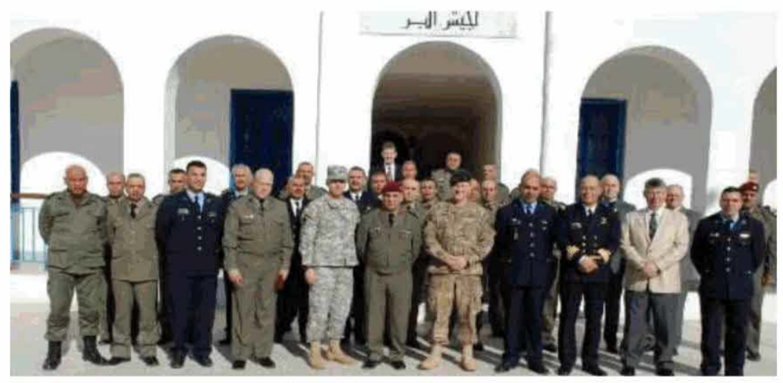
FY14 CTFP JSOU MET - Tunisia