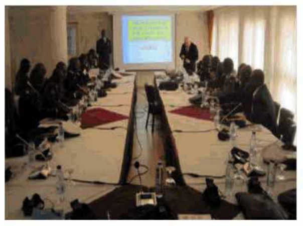
FY14 CTFP CCMR Regional MET - Cameroon

In the Lake Chad Basin, the CTFP coordinated a CCMR MET in Yaoundé, Cameroon, from June 9 – 13, 2014. This regional seminar emphasized a whole-of-government approach to strategizing and addressing security threats emanating from Boko Haram. More than 30 military personnel and national police officers from Cameroon, Chad, Niger, and Nigeria participated. Partner nations' attendees shared lessons learned in developing peer-to-peer approaches for defeating Boko Haram.