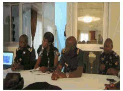
CCMR Training in Niger June 2014

The CTFP funded a CCMR MET counterterrorism workshop in Niamey, Niger. The