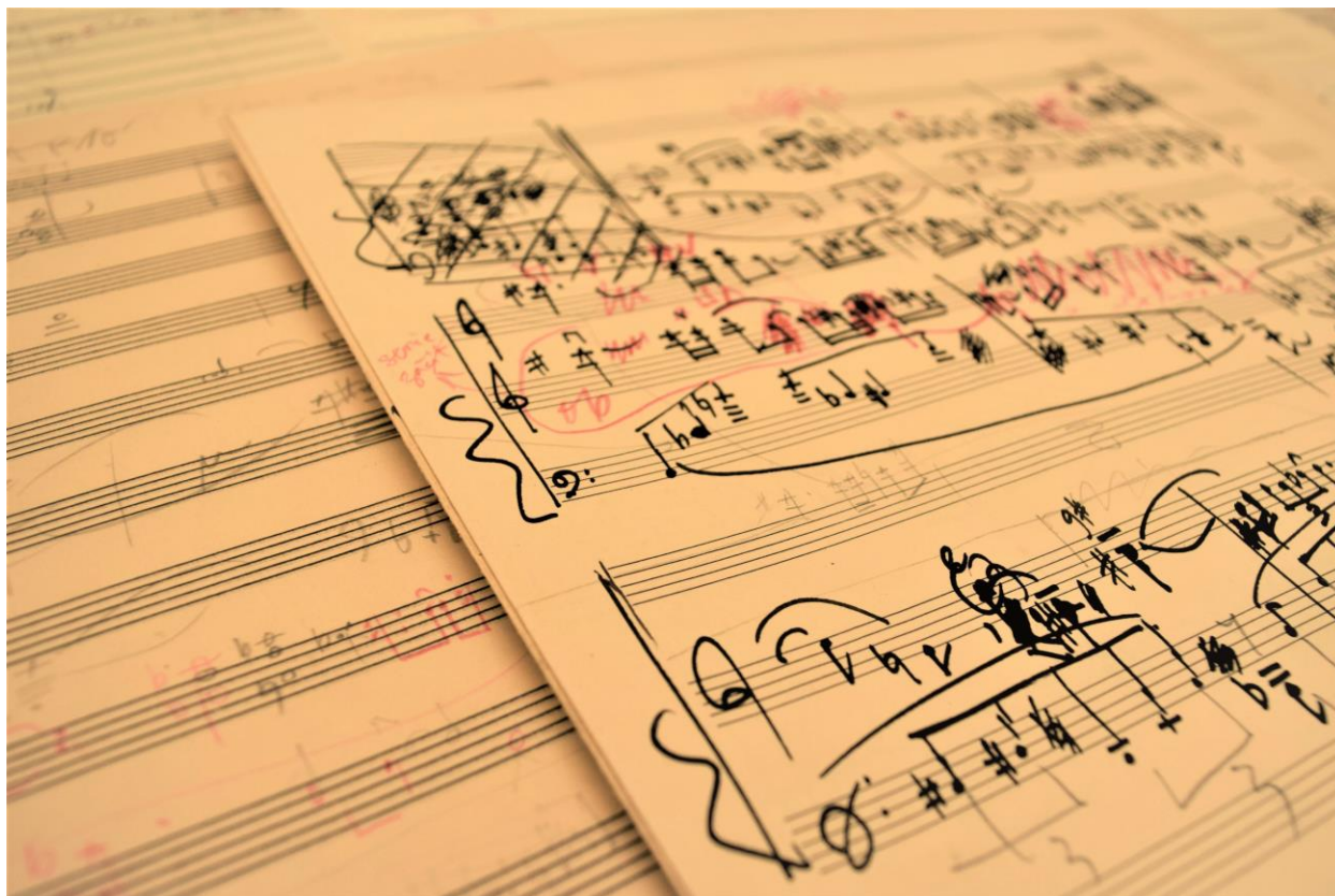
Karel Husa, manuscript sketches to Music for Prague 1968 [for concert band.] From Karel Husa Archive, Box 85/9.