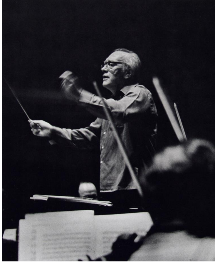
Karel Husa in rehearsal with the Rochester Philharmonic Orchestra (1970).