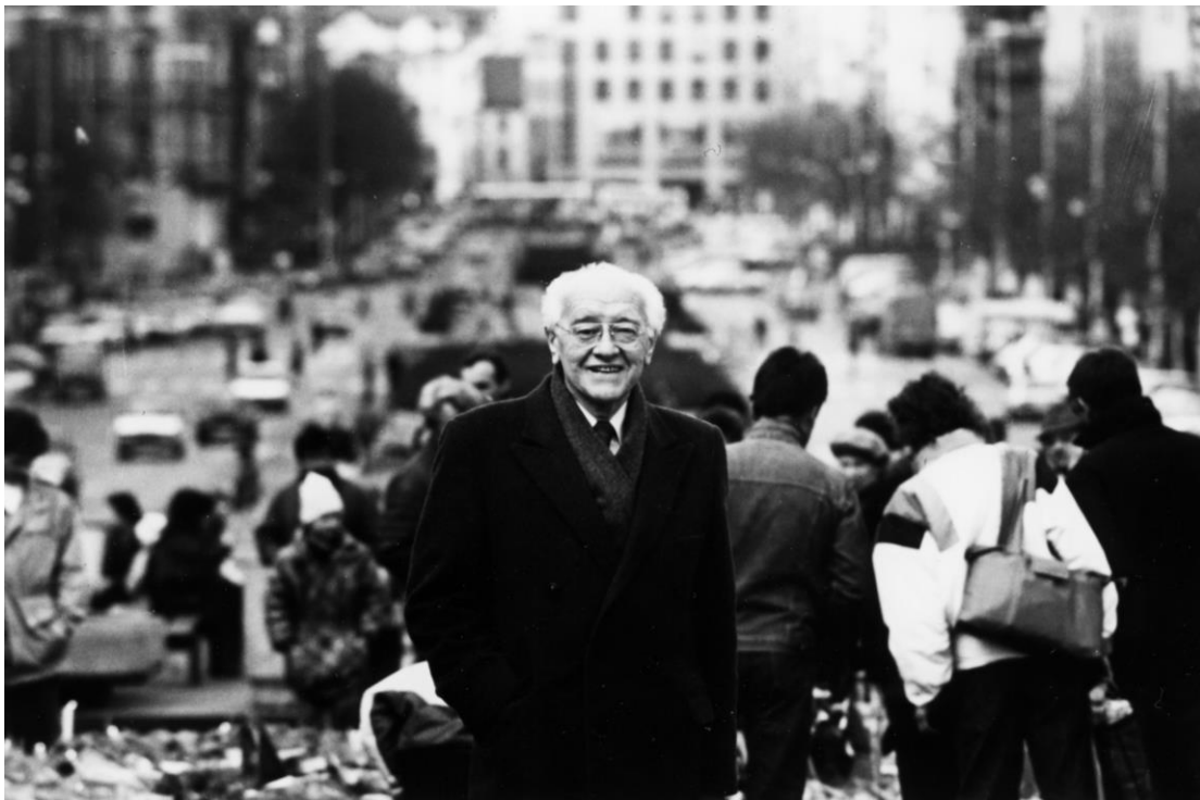
Karel Husa at Wenceslas Square, Prague (February 1990).