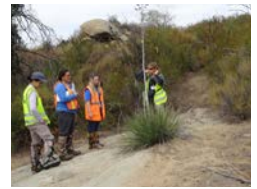
Monitoring continues as soil sampling winds down Page 6

Community involvement annual report special edition Page 4