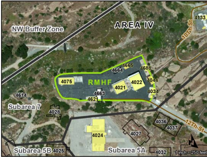
Figure 2: Building footprints near the RMHF

So, what questions could GIS answer as the EIS analysis proceeds? GIS can answer questions about location. For example, if an analyst asked the question: "What buildings are remaining in the vicinity of the RMHF?" GIS can do that. The yellow shapes in the map below show the remaining buildings in and near the RMHF in SSFL Area IV.