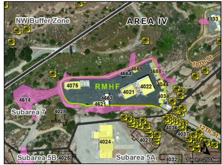
Figure 5: Building footprints, Santa Susana tarplant, and known areas of contamination near the RMHF

Because specific layers of information can be turned "on" or "off," or combined in different ways, GIS can be used to make certain applicable regulatory requirements are adhered to. For example, SSFL Area IV EIS analysts will want to know whether endangered plants are in the vicinity of buildings slated for removal, and if so, propose actions to lessen or remove any possible impacts. As the cleanup process moves forward, if project staff want to correlate this data with known areas of contamination around the RMHF, they could utilize a map like the one below. Using this map, they could make recommendations, if necessary, on ways to make sure that plants are protected during building demolition and steps are taken to ensure the safety of personnel in the field.