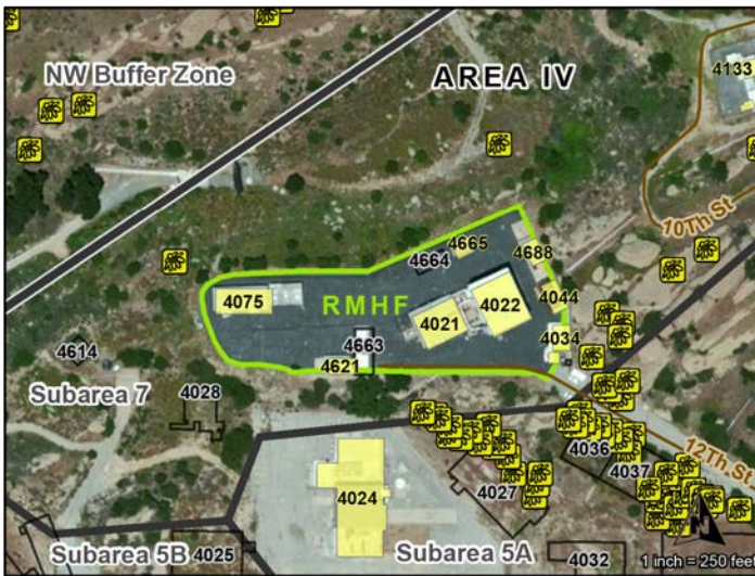
Figure 3: Locations of Santa Susana tarplant near the RMHF

Another question GIS could answer: "Where are the locations of Santa Susana tarplants near the RMHF?" The small, dark-yellow squares in the map below show the locations of the tarplants near the RMHF.