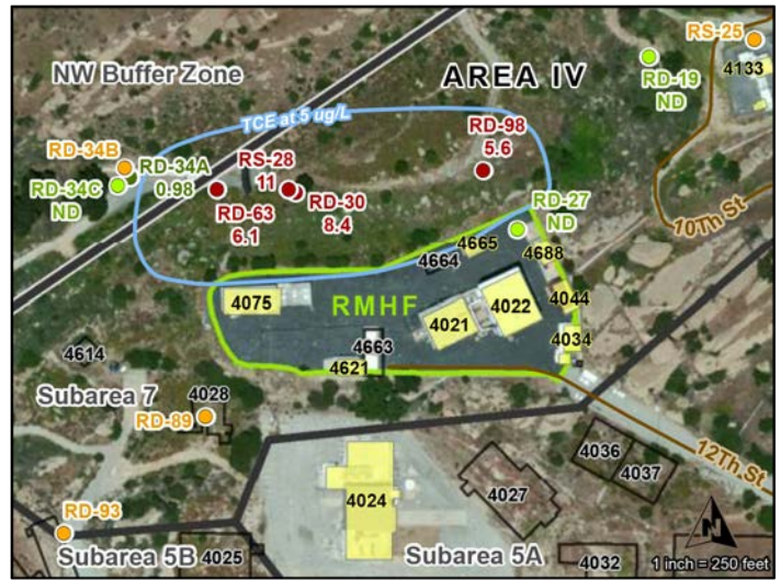
Figure 4: Well locations and TCE plume near the RMHF

GIS can answer questions about the extent and locations of specific types of contamination. If an analyst had a question about sampling well locations and where trichloroethylene (TCE) plumes have been found, GIS has the answer: red dots in the map (Figure 4) represent locations where TCE has been found above the detection limit; the blue circle represents the extent of the TCE plume.