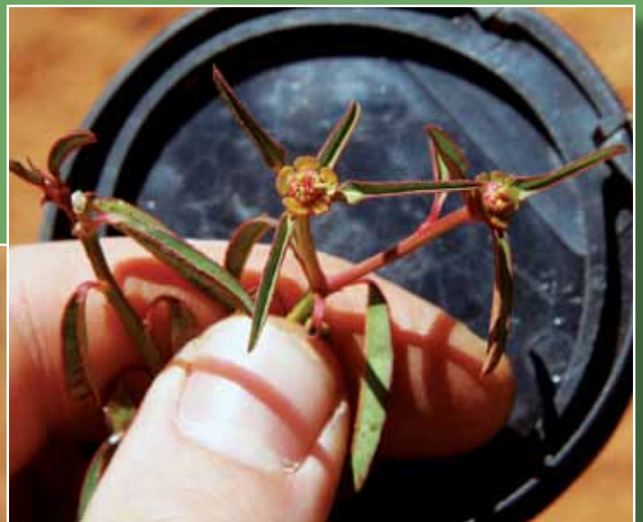
Here we have the herbaceous Euphorbia crotonoides subsp. crotonoides Boiss., a member of subgenus Rhizanthium . This species was collected in the western Rukwa Region, between Sumbawanga and Mpanda.