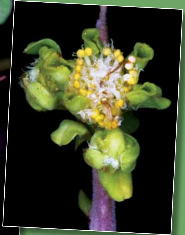
The road to Chome was filled with Euphorbia! Here we have the shrubby E. cuneata Vahl with its characteristic spine-tipped branches. This species belongs to subgenus Rhizanthium . Check out those cup-like green cyathial glands!