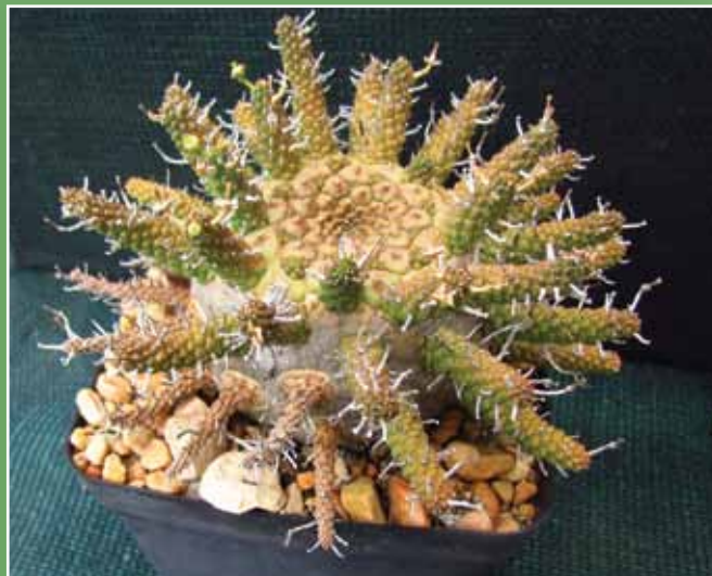
Fig. 8: A 25 year old plant of Euphorbia gamkensis in cultivation (1989 seedling) to illustrate the full mature size and shape of E. gamkensis .