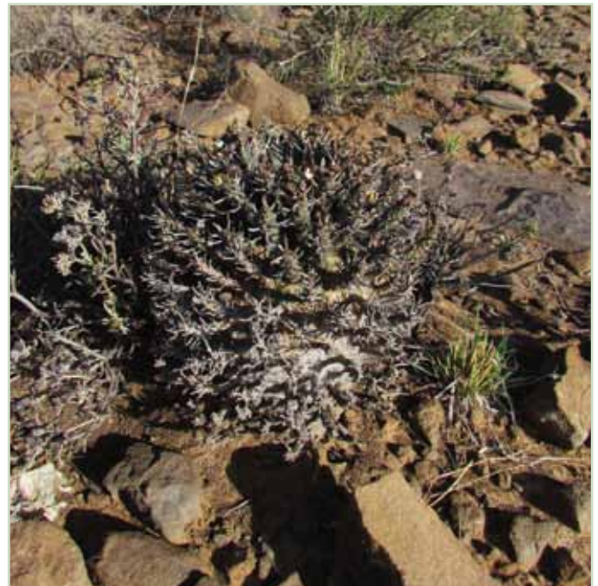
Fig. 5: An attractive globose-shaped plant of Euphorbia crassipes with above-ground main stem about as thick as high, growing on the outskirts of Beaufort West.