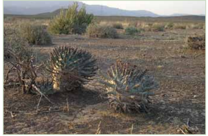
Fig. 3: Old mature plants of Euphorbia crassipes on the Karoo flats to the west of Beaufort West with the Nuweveld Mountains in the far distance

from both E. crassipes and E. fusca in numerous features with the most obvious difference the lack of finger-like processes along the margins of the glands.