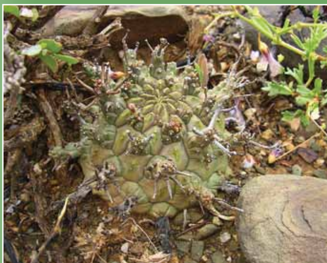
Fig. 11: An attractive specimen of Euphorbia decepta with unusually short branches on the farm Kruidfontein north-west of Willowmore.