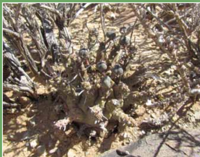
Fig. 10: The branches of Euphorbia decepta in the Willowmore area have the tendency to be less "spiny" than the ones further north near Aberdeen and the plants are often deeper sunken into the soil in the Willowmore and Rietbron areas.