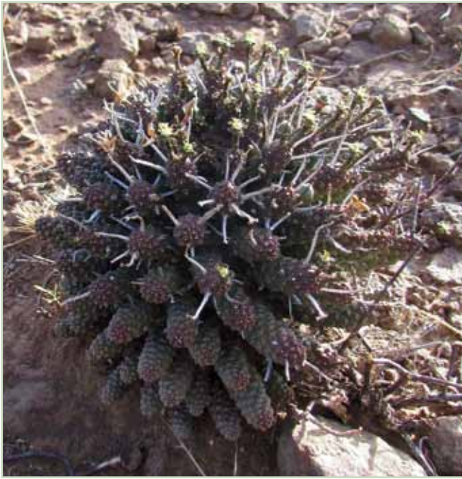
Fig. 6: A natural hybrid between Euphorbia braunsii and Euphorbia crassipes growing near Beaufort West. Branches of this hybrid are considerably thicker and closer spaced than the ones on normal plants of Euphorbia crassipes .

Therefore, in an effort to break this cycle of ongoing confusion, let me list the facts as known to me through investigation of live plants as well as original scientific texts: