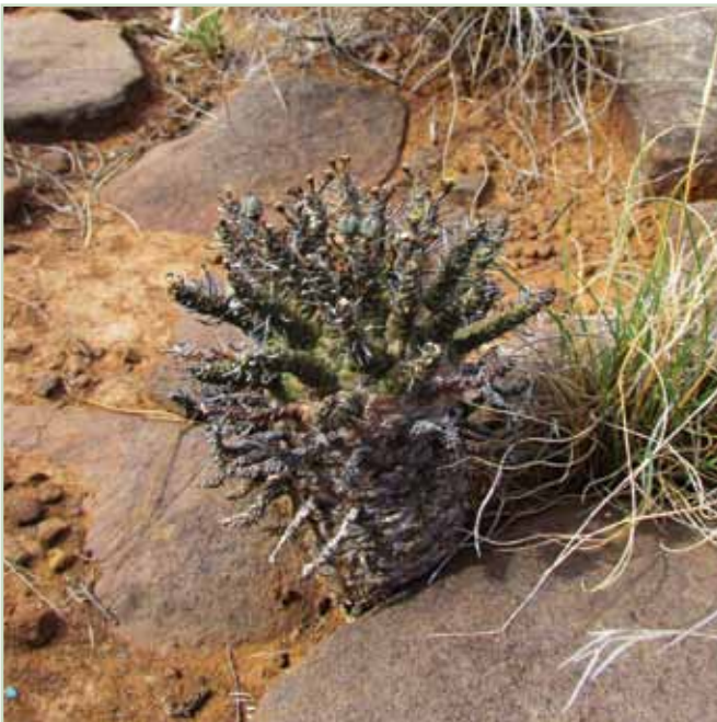
Fig. 4: A plant of Euphorbia crassipes with a cylindrical main stem standing about 15 cm above ground, but thickness of the stem in this case is less than 10 cm.

The situation surrounding E. crassipes has therefore developed into a rather complicated puzzle which demands more than just superficial inquisitiveness to unravel. To the average unconcerned person who mainly looks at pictures without reading the accompanying texts carefully, the visual image of E. crassipes probably still remains as those pictures of E. gamkensis on pages 431 and 432 in White, Dyer and Sloane's Volume 1. At the other end of the scale are such approaches as the above-mentioned article that appear to envision it as more erudite to base deductions mainly upon the interpretation of century-old and rather fragmentary original published texts and with little evidence of close and current investigation of the plants themselves.