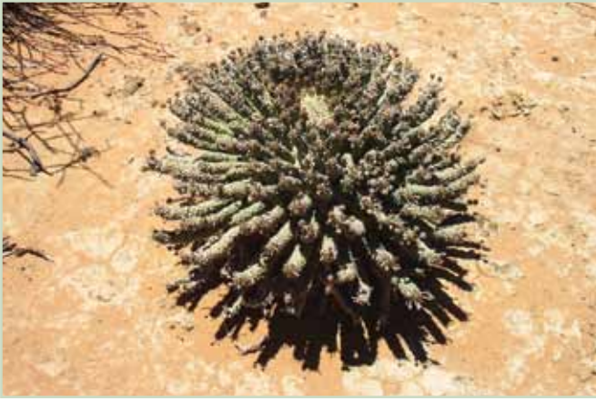
Fig. 2: An average-sized adult plant of Euphorbia fusca in habitat near Britstown. Note the 'cristate-like' grooved apex which is typically present in all mature plants of this species.