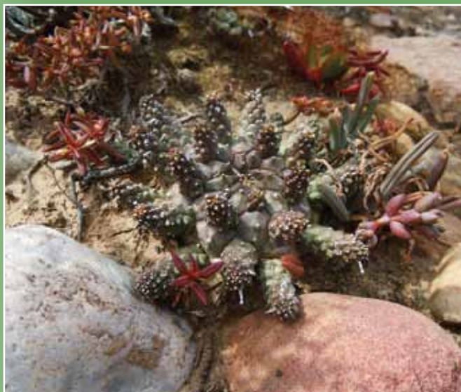
Fig. 7: An average-sized plant of Euphorbia gamkensis in habitat, south east of Calitzdorp.