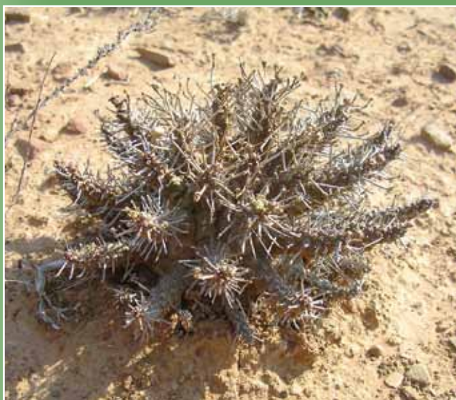
Fig. 9: A rather bristly mature plant of Euphorbia decepta growing to the west of Aberdeen.