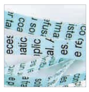
Security level 1 · Strip cut