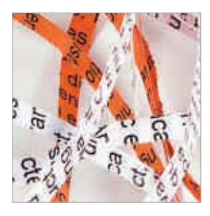
Security level 2 · Strip cut

Suitable for companies, administration offices and private use