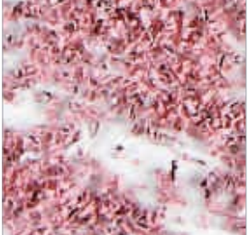
Highest security \cdot Particle 0.7 x 2.6 mm

Suitable for government offices, authorities, secret services (FBI)