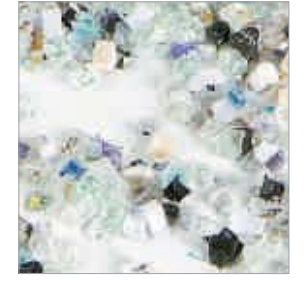
Particle 2.2 x 4 mm · CDs

For confidential data on CDs, DVDs, credit or customer cards, such as personal data.