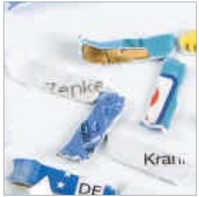
Particle \cdot 3.9 x 40 mm \cdot CDs

For confidential data on CDs, DVDs, credit or customer cards, such as personal data.