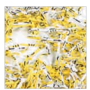
Security level 5 · Particle cut

Suitable for doctors, hospitals, development work, company management