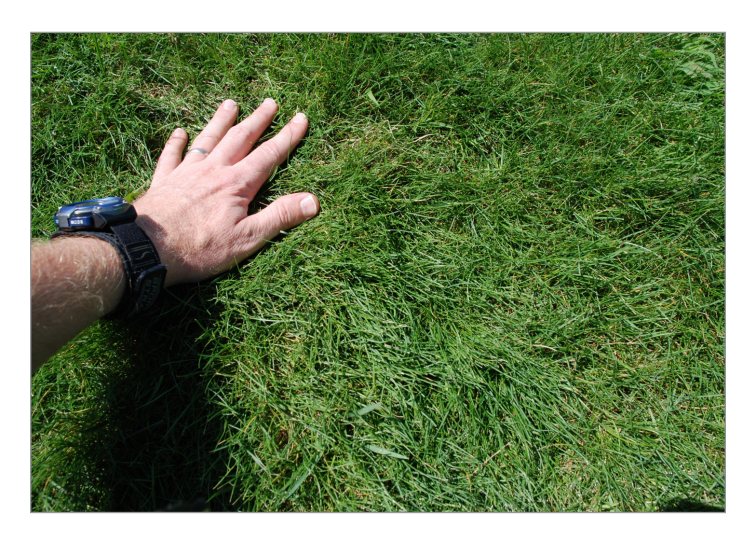
Figure 3. Chewings fescue. Notice the fine leaf texture (narrow leaf width) compared to tall fescue in Figure 2.

Fine fescues are used across a range of turfgrass systems, including home lawns, commercial properties, golf courses, parks, roadsides, low-input sites, and other utility turf. Five fine fescue turfgrasses are commonly used in turfgrass systems: strong creeping red fescue (Festuca rubra L. ssp. rubra), slender creeping red fescue (Festuca rubra L. ssp. littoralis), Chewings fescue (Festuca rubra L. ssp. commutata, synonym Festuca rubra L. ssp. fallax) (see footnote on the common name of Chewings fescue