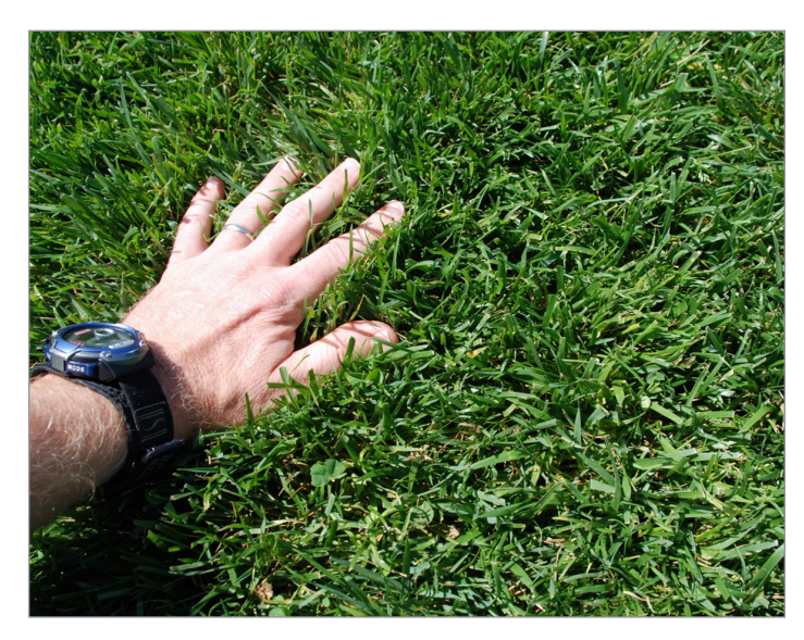
Figure 2. Tall fescue (turf-type).