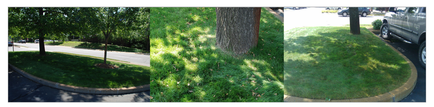
Figure 5. An example of the excellent shade tolerance with a dense fine fescue mixture canopy under tree shade.

fescue, slender creeping red fescue, Chewings fescue, sheep fescue, and hard fescue. Using the information described in this publication, our goal is for homeowners and practitioners to have a better understanding and confidence in choosing and utilizing fine fescue taxa (strong creeping red fescue, slender creeping red fescue, Chewings fescue, sheep fescue or hard fescue) or mixture of multiple fine fescue taxa based on site conditions, expectations, and management practices to enhance sustainability.