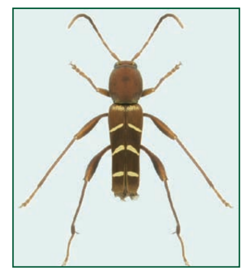
Figure 4. Adult Neoclytus acuminatus.

Damage and Signs of Attack: Larvae of both species of ash borer feed on recently killed or cut hardwoods. Although weakened trees are at risk