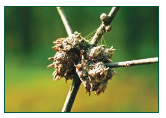
Figure 17. A horned oak gall on pin oak. (USDA Forest Service-Northeastern Area Archive, USDA Forest Service, Reproduced with permission, www. bugwood.org)

Galls are irregular plant growths formed by plant hormones interacting with growth-regulating chemicals produced by some insects and mites. Galls are often caused by the overproduction of the plant hormones auxin and cytokinin. These plant hormones not only stimulate cells to grow abnormally large, but also to divide more rapidly. Feeding by gall-making parasites causes adjacent plant tissues to form the gall. The parasite then