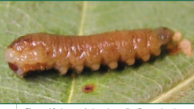
Figure 10. Larva of pin oak sawfly.

Damage and Signs of Attack: The larvae (Fig. 10) of this species feed on the bottom of oak leaves, leaving the veins and top layer of the leaves intact. The immature sawflies are greenish caterpillars and superficially resemble immature moths and butterflies.