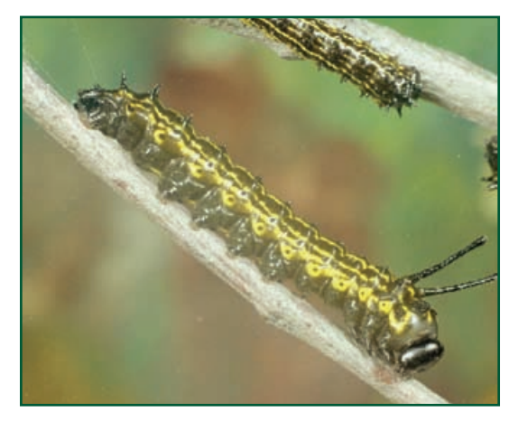
Figure 15. Orangestriped oakworm caterpillar. (Clemson University- USDA Cooperative Extension Slide Series, Reproduced with permission, www. bugwood.org)

Silkmoths. The silkmoths (Lepidoptera: Saturniidae) are among the largest (75 to 150 mm wingspan) and most colorful moths in North America. The brightly colored larvae are guite large and armed with tubercles or spines. The eggs are also relatively large and deposited on the foliage of hosts. Most species overwinter on the host or in leaf litter in large, densely spun silk cocoons. An important defoliator within this group is the orangestriped oakworm (Fig. 15), Anisota senatoria, which feeds on oaks, especially red oak. The larvae are black colored with distinctive orange stripes and can grow to a length of ~50 mm. Adult moths emerge and lay eggs on the undersurface of leaves from June to July. Larvae feed for five to six weeks and then pupate in the soil. One generation occurs per year (Craighead 1950).