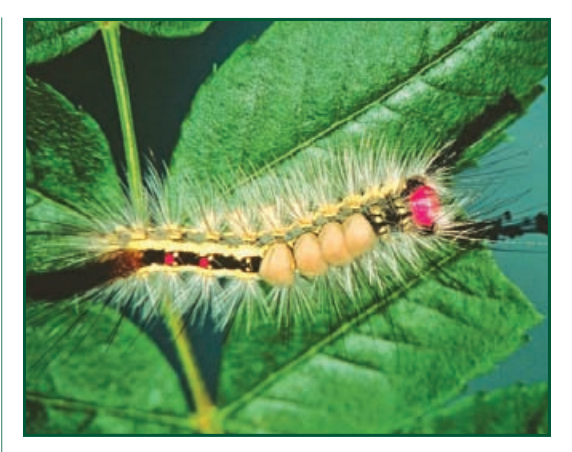
Figure 13. Caterpillar of the whitemarked tussock moth.

Hosts: At least 60 species of hardwood tree are attacked by this insect, especially maple ( Acer spp.), elm, birch ( Betula spp.), sycamore, and poplar.