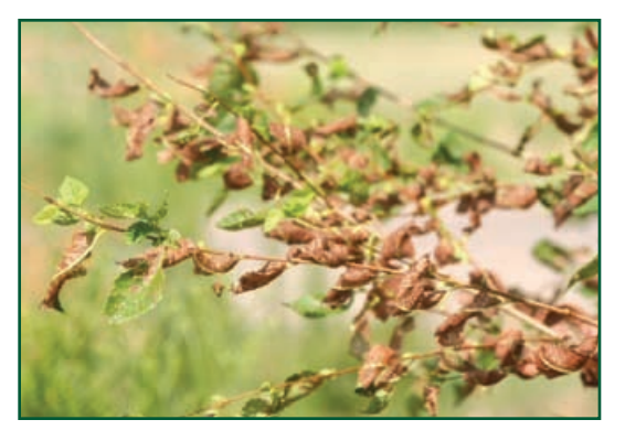
Figure 16. Leaf damage caused by elm leaf beetle.

feed on foliage (Fig. 16), the immature stages are by far more destructive. Larvae feed on the underside of the leaf, leaving the upper surface intact. This leads to the death and loss of badly damaged leaves. The larvae are initially entirely black, but as they mature, their color changes to a greenish or yellowish color with a black lateral stripe. Mature larvae move to the base of the tree to pupate. There are often two generations per year, and these insects do not disperse long distances, with successive generations often reinfesting the same tree. Extensive feeding by these beetles over several years can severely weaken or even kill a tree (Johnson and Lyon 1994). Adults overwinter and begin to feed and lay eggs in the spring. Larvae are small, grub-like, and feed on the bottom of leaves.