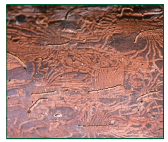
Figure 1. Elm bark beetle galleries.

Life Cycle: Adults overwinter within the bark of live trees. In the spring, beetles emerge and colonize moribund trees. However, under high