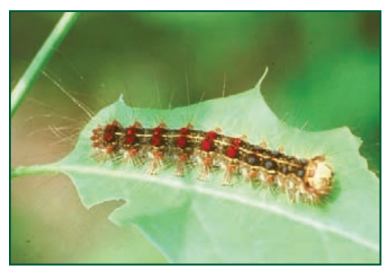
Figure 12. Gypsy moth caterpillar.

Damage and Signs of Attack: The larvae begin feeding in the crown of a tree, chewing small holes out of the leaves. Later, instars consume the whole leaf. In fact, a single gypsy moth larva can consume as much as 1 m<sup>2</sup> of foliage in its lifetime. Not surprisingly, large populations of gypsy moth caterpillars (Fig. 12) on a single tree can lead to complete defoliation.