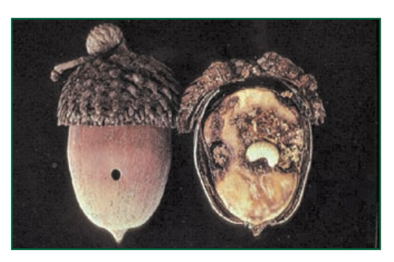
Figure 6. Acorn damage caused by a Curculio weevil.

Weevils are the most important nut-feeding insects affecting hardwood trees. This family ( Curculionidae ) contains over 2,000 North American species, a small number of which attack the fruits of oak, hickory, and pecans. The adults are light tan to reddishbrown and can have a long, slender, curved beak or