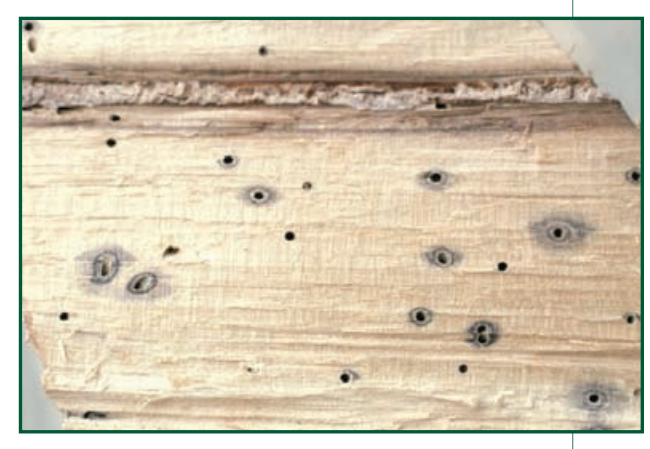
Figure 3. Damage to pecan by black stem borer.

Hosts: Over 200 species (Weber and McPherson 1983), usually attacking small stems or recently dead trees (Fig. 3).