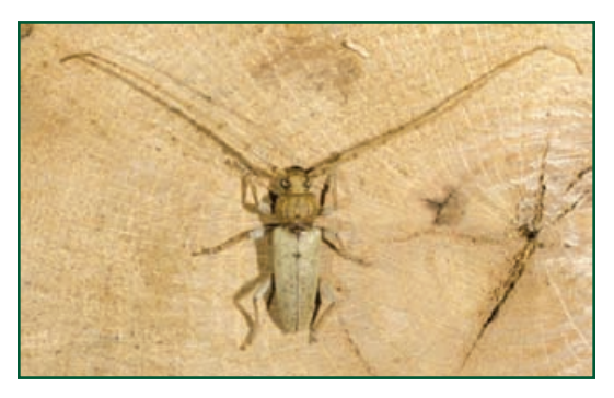
Figure 5. Adult red oak borer.