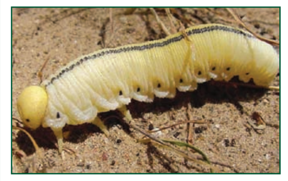
Figure 11. Larva of elm sawfly.

Damage and Signs of Attack: Larvae (Fig. 11) are yellowish-white with a single black stripe and can reach ~50 mm in length. The larvae feed on foliage during the summer, often wrapping part of their body around a twig for support while it eats.