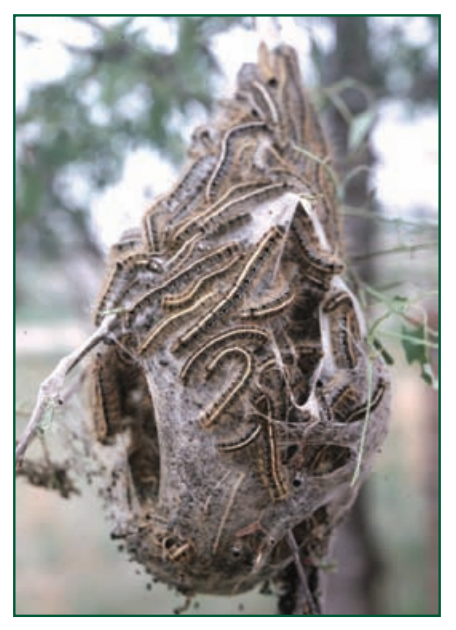
Figure 14. Eastern tent caterpillars.

(Lepidoptera: Lasicampidae) are generally hairy and many spin conspicuous silken tents, where they reside during inclement weather and while molting. This behavior is not unique, however, as many other lepidopteran families also make tents of silk. An important defoliator in this group is the eastern tent caterpillar ( Malacosoma americanum ), which feeds on a variety of Prunus species and other hardwoods. Eastern tent caterpillars (Fig. 14)