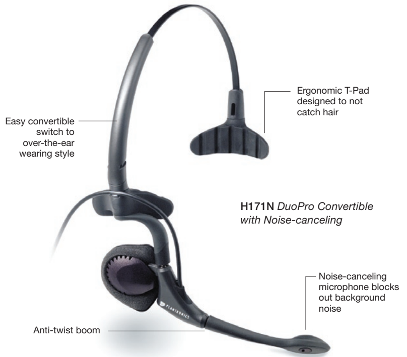
H171N DuoPro Convertible with Noise-canceling