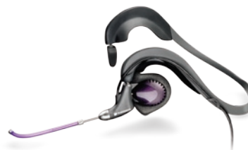
H171 DuoPro Voice Tube model, shown with accessory neckband for behind-the-head wearing. Neckband is sold separately.

DuoPro headsets require a Plantronics audio processor, USB audio processor, or direct connect cable to connect to phone or PC.