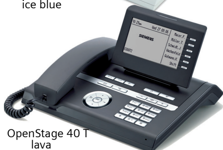
OpenStage 40 T lava