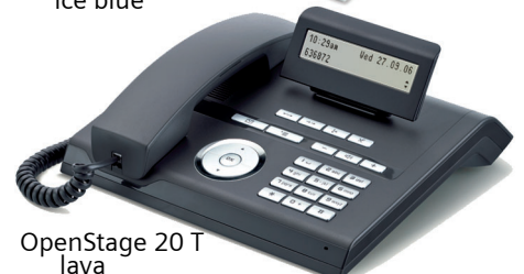
OpenStage 20 T lava