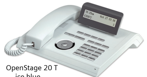
OpenStage 20 T ice blue