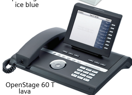
OpenStage 60 T lava