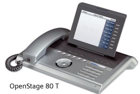
OpenStage 80 T