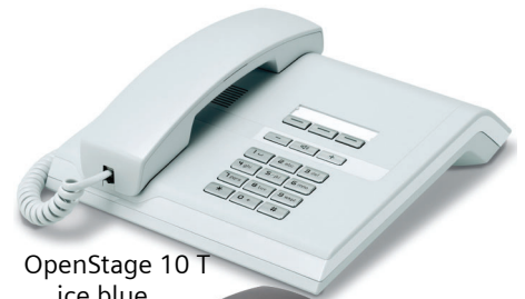
OpenStage 10 T ice blue