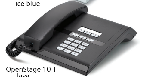
OpenStage 10 T lava