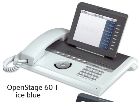
OpenStage 60 T ice blue