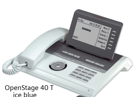
OpenStage 40 T ice blue