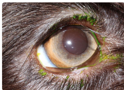
Above right an eye prior to treatment for distichiasis. On the above left the same eye 2 weeks after repeat treatment with electrolysis – no lashes are left.