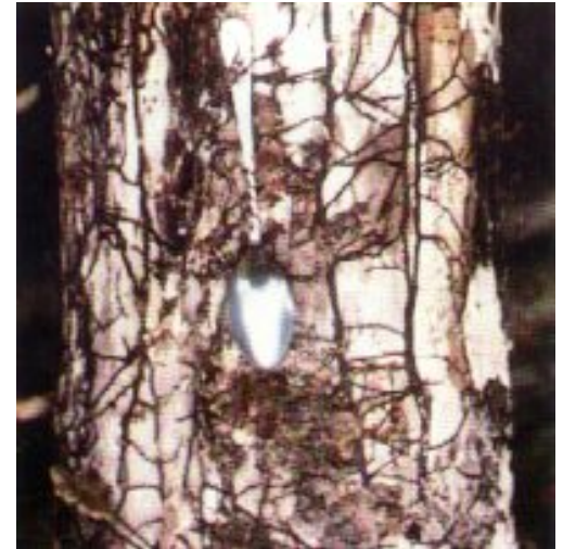
Shoe string like rhizomorphs of Armillaria sp. not seen in South Africa.

to remove in future rotations. Control through selection for resistance in species is a strategy that has been considered. The extremely wide host range of the pathogen suggests that this approach would hold little promise, although it is currently under investigation in South Africa.