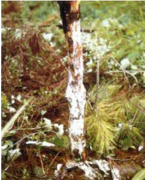
White mycelial mat under the bark of a dead tree.