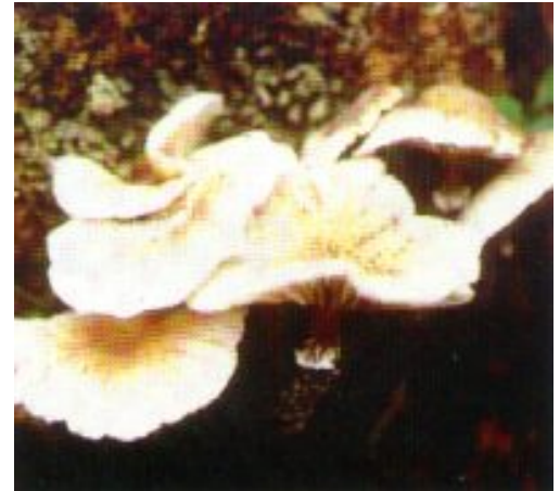
Mushroom like fruiting structures of Armillaria sp. thought to be A. heimii .

In forestry situations, Armillaria root rot has been recorded on both pines and eucalypts although there is some doubt as to whether the disease is serious in eucalypts. There is some evidence to suggest that where eucalypts are planted in pine infection centres, the eucalypts will not be affected by this disease. This might imply that at least one of the species of Armillaria present, displays some level of host specificity. This aspect of the biology of Armillaria in South Africa deserves further consideration.