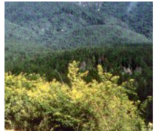
Armillaria root rot centre in a pine plantation.

If you need any further information, please contact us .