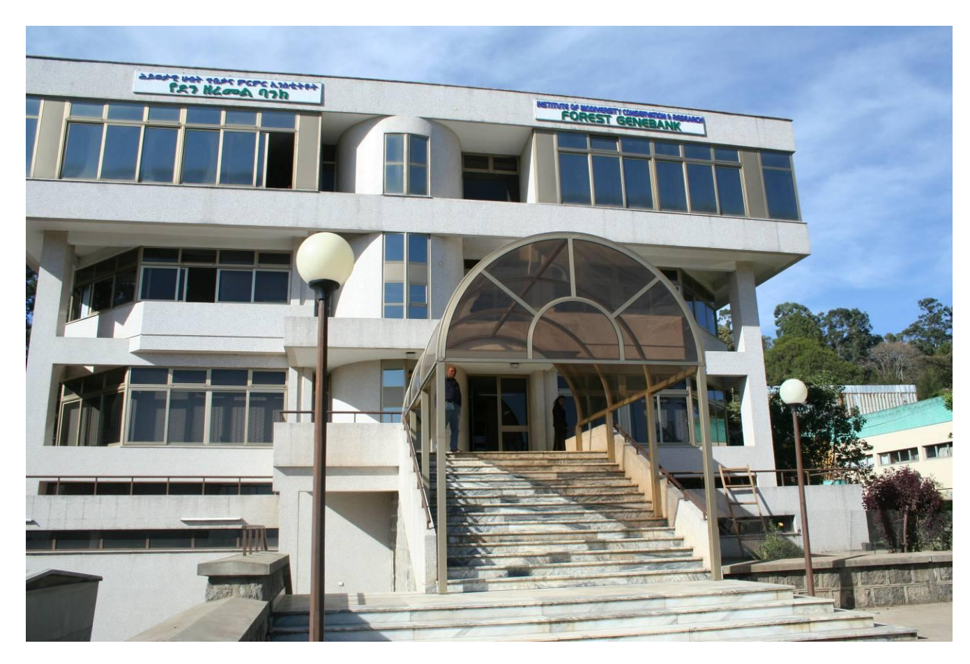
Figure 2. Ethiopian Forest Gene Bank

Seeds of priority and conservation worthy forest plant species had been collected to be conserved ex situ , both in the cold room and in the field gene banks. A total of 498 accessions of 93 forest species have been collected out of which 468 are conserved (Table 11). A total of 42 medicinal and forage plant species are collected and conserved in the ex situ field gene banks. In addition, 5238 accessions of coffee have been conserved in two field gene banks. Moreover, information on 468 conserved accessions has been organized and documented. On the other hand, about 85 accessions of the conserved tree and shrub species have been distributed to Governmental and Non-governmental Organizations, Agricultural Research Centers, Higher Learning Institutions, Community Organizations, and individuals for research and development.